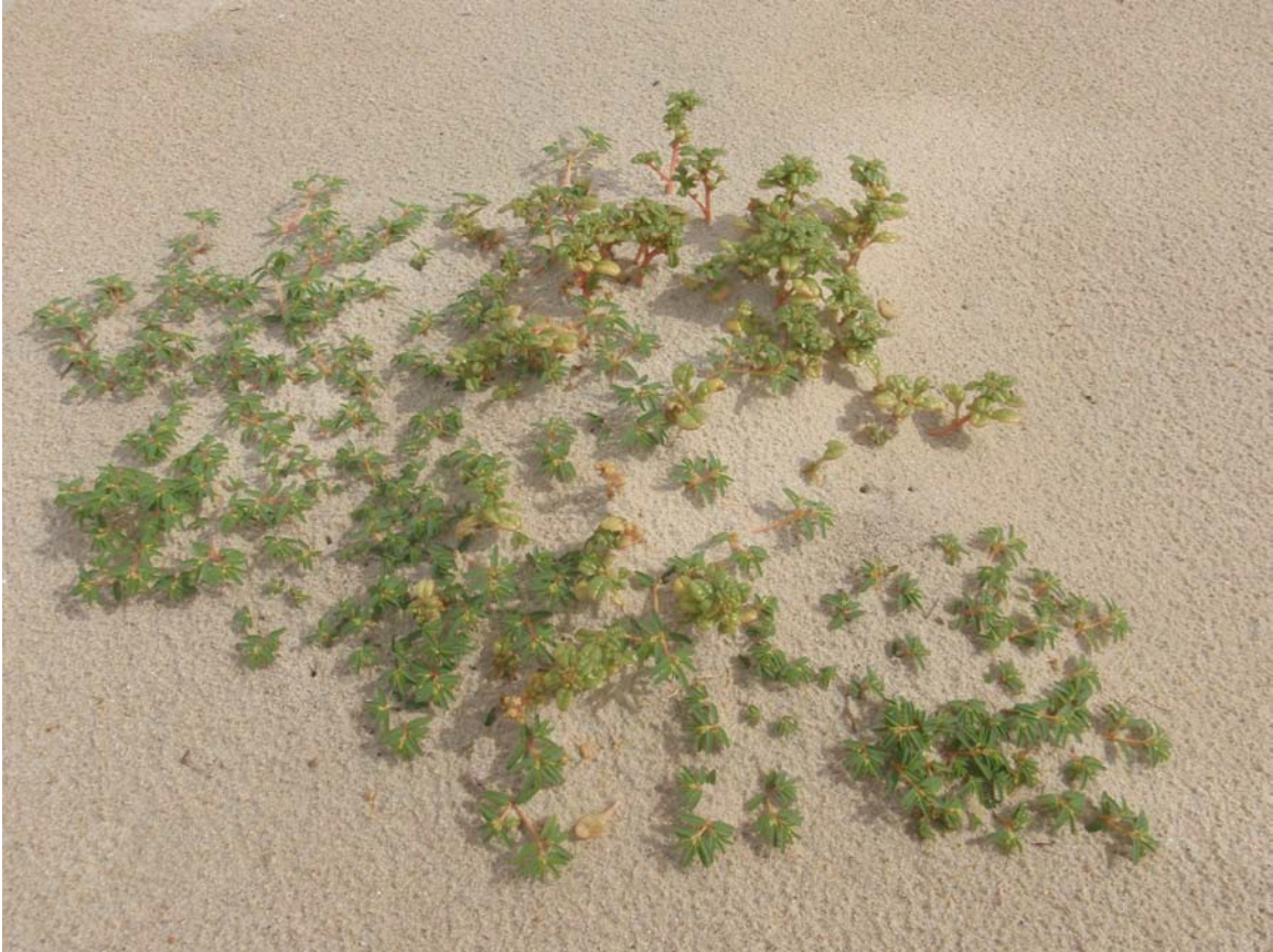
Seabeach Amaranth and Dune Spurge on Shackleford Banks.