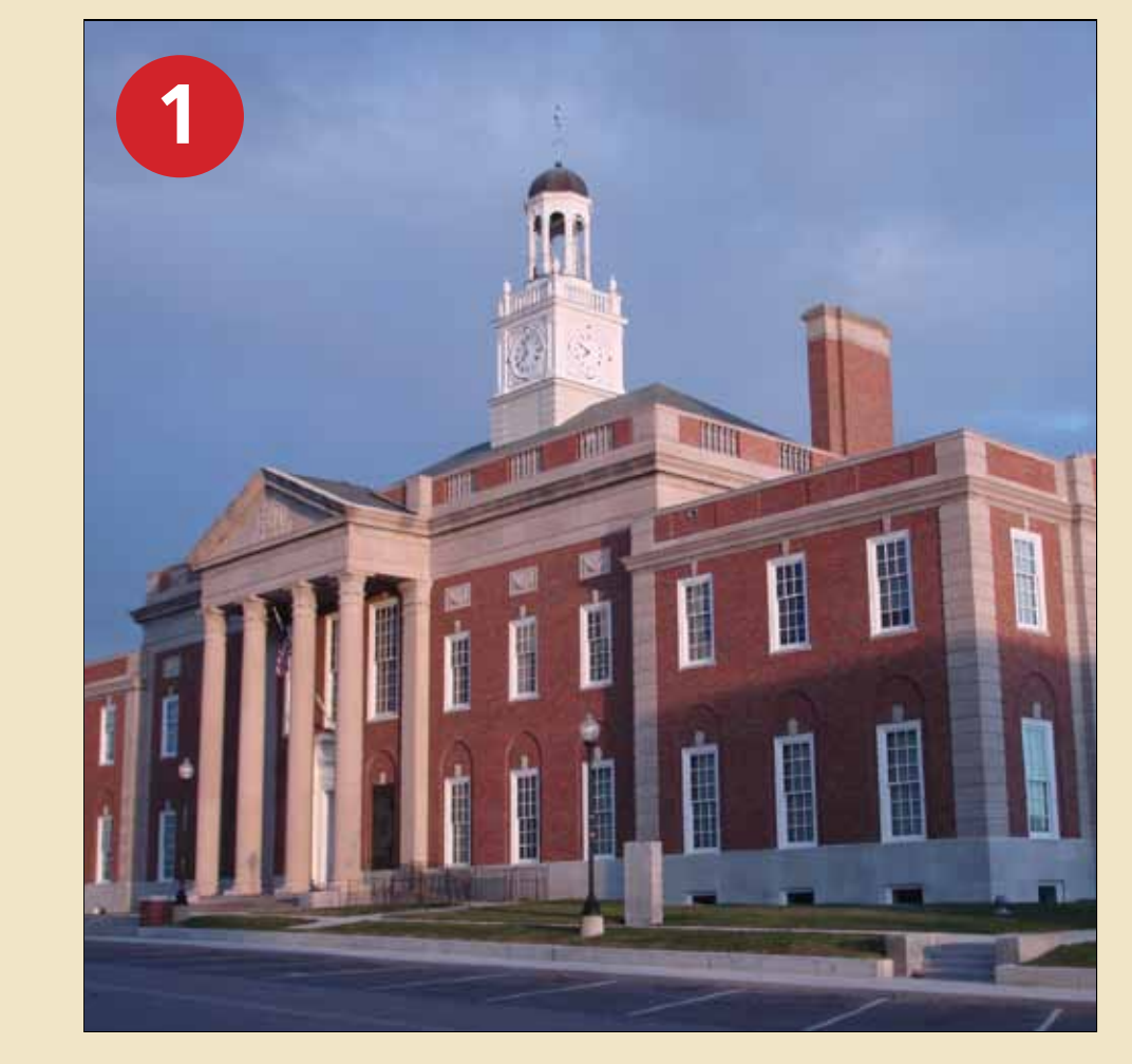
Independence Square Stores, warehouses, hotels, saloons, medical and law offices, and banks surrounded the Jackson County Courthouse, the governmental and administrative seat. Wagons departed with excitement and anticipation.