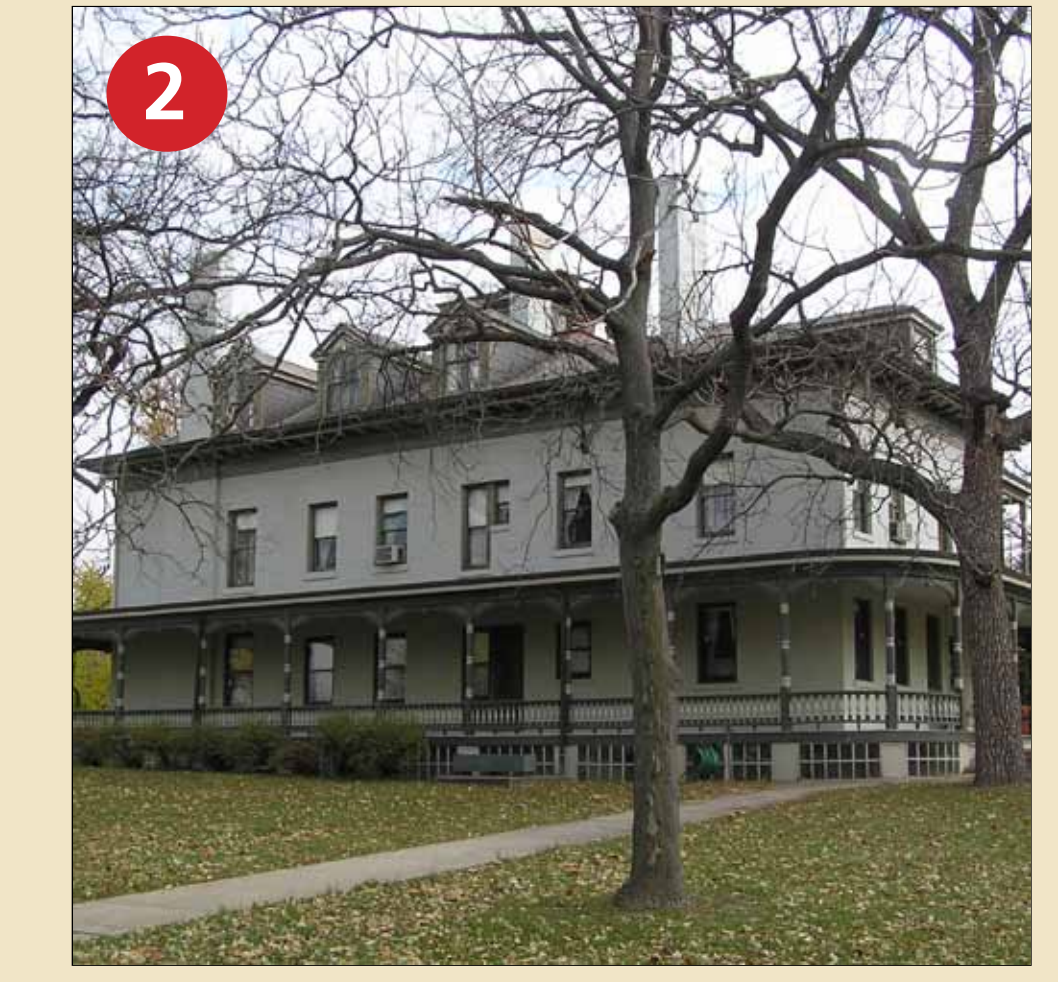
Lewis-Bingham-Waggoner Estate - The home of artistpolitician George Caleb Bingham, this house was later occupied by the Waggoner family who operated the flour mill across the street. Look for shallow swales on the south side of the property.