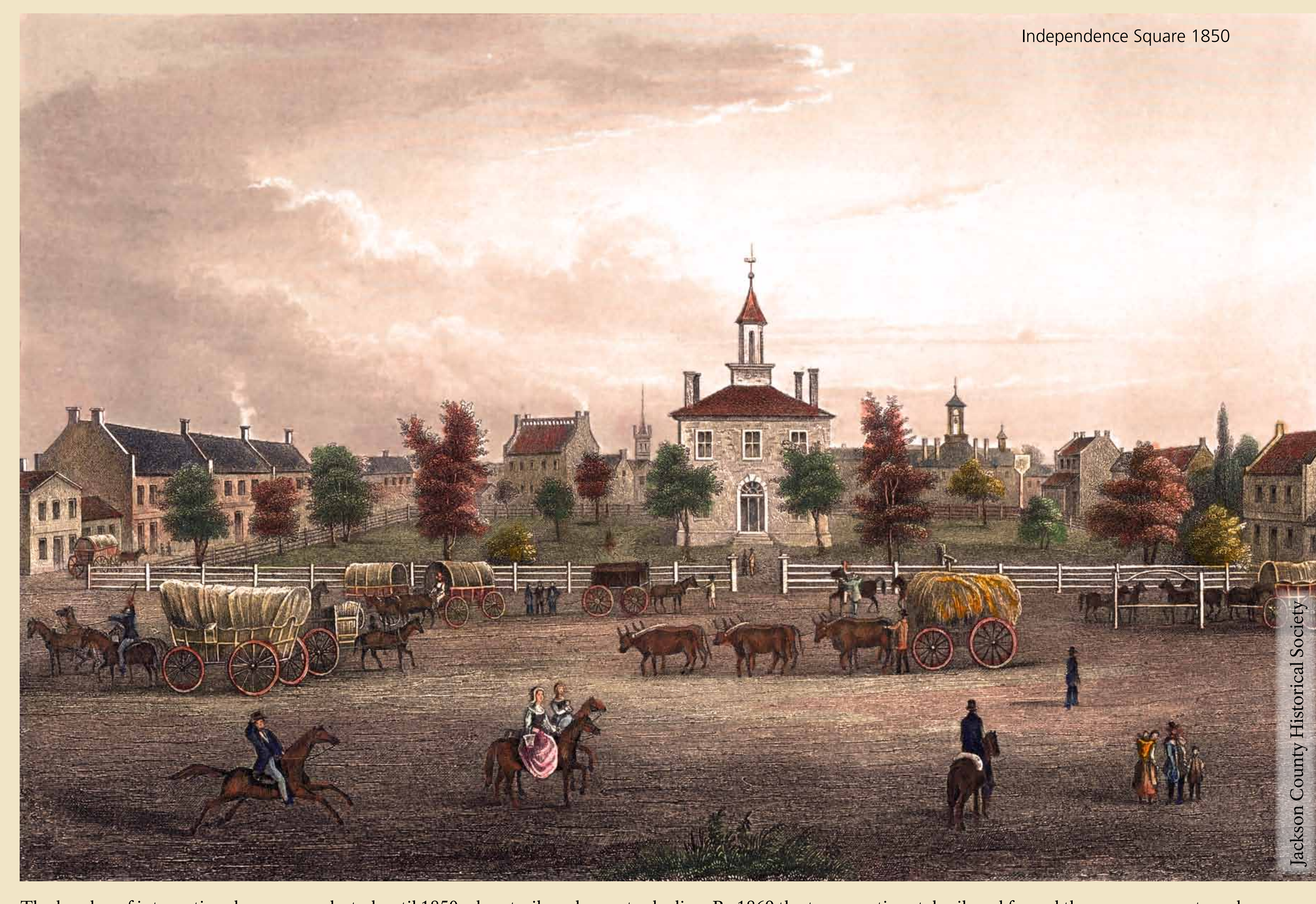
The heyday of international commerce lasted until 1850 when trail use began to decline. By 1869 the transcontinental railroad forged the new way westward.