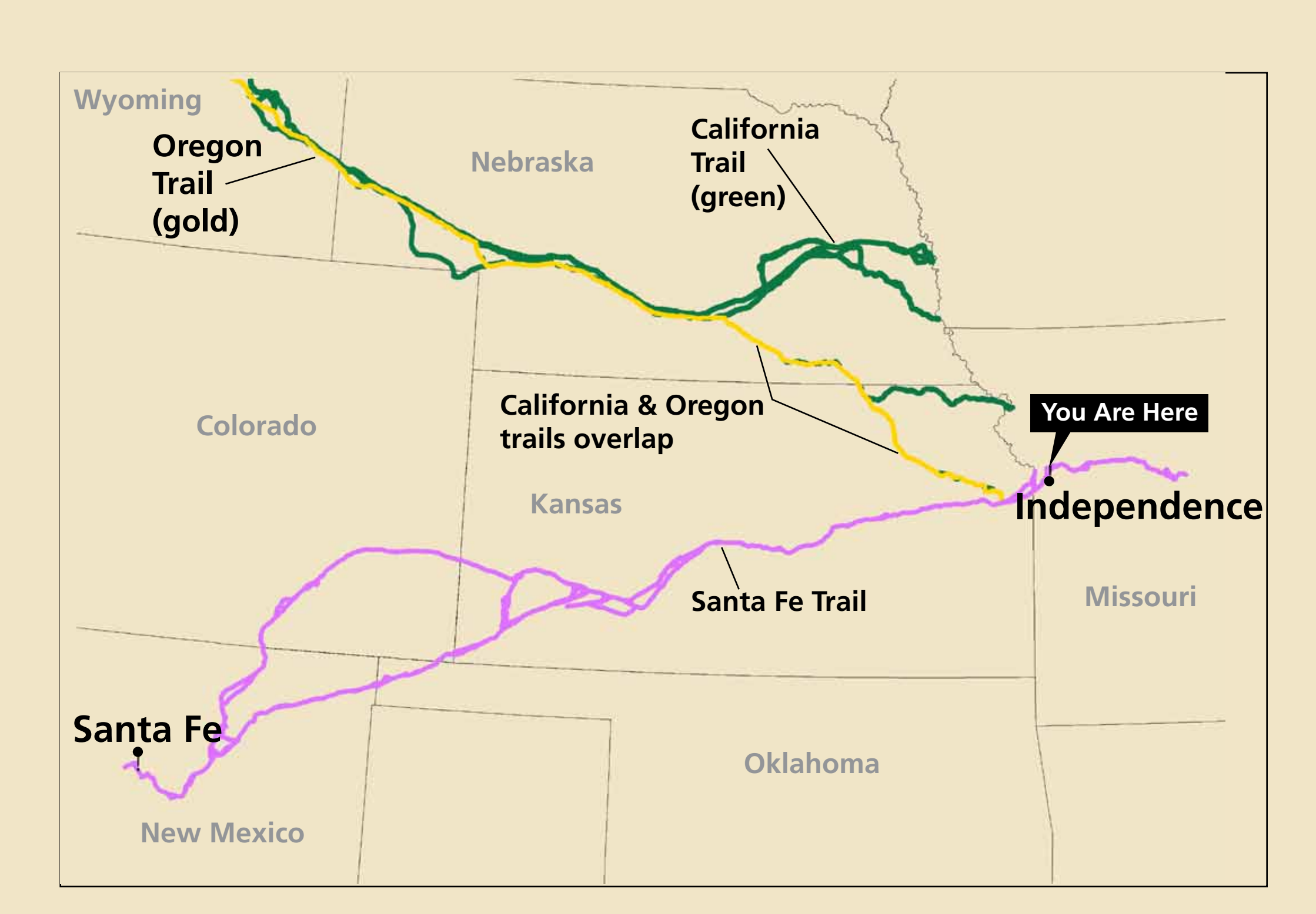
The Santa Fe Trail opened trade barriers from Missouri to Mexico, providing economic inroads into America that tendered riches all the way to Europe. Loaded with all of the goods that Independence readily supplied, emigrant wagon trains surged onto the Oregon and California trails—tramping across plains and over the Continental Divide toward the promise of wealth and land.

Arriving in early spring, emigrants prepared for the journey of a lifetime. They had filled the hotels and boarded or camped on nearby farms. Now they could depart with their livestock nourished by spring grasses.