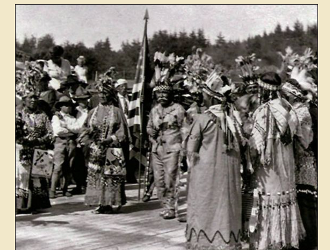
Siletz Feather Dance Confederated Tribes of Siletz Indians (a confederation of tribes from northern California to southern Washington)

You might ask me, ‘What did the land mean to your people?’ I could answer, ‘The very meaning of our life.’