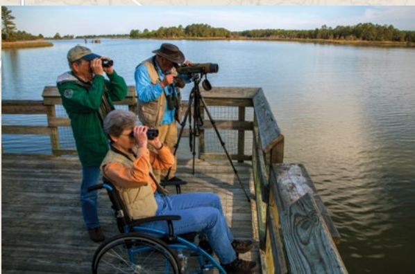
Tidal marshes are a haven for birdwatchers.