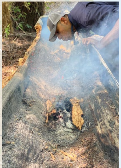
A demonstration of how to build dugout canoes.