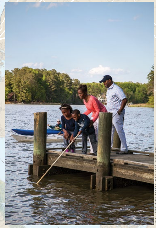
Fishing is a treasured Chesapeake tradition.