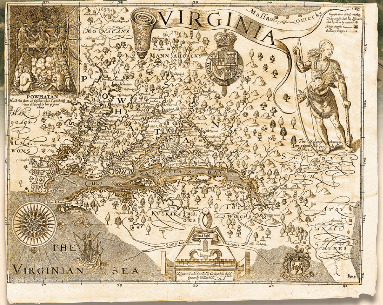
Mapping the Chesapeake: Captain John Smith's map of the Chesapeake was remarkably accurate for the time, created using navigational tools like a compass, sundial, and chip log. Smith explored the landscape by boat and on foot. Indigenous people informed him about places he did not reach in person.

Today, you can follow Smith's travels on the Captain John Smith Chesapeake National Historic Trail. By land or by water, you'll find something captivating along each of the trail's diverse waterways.