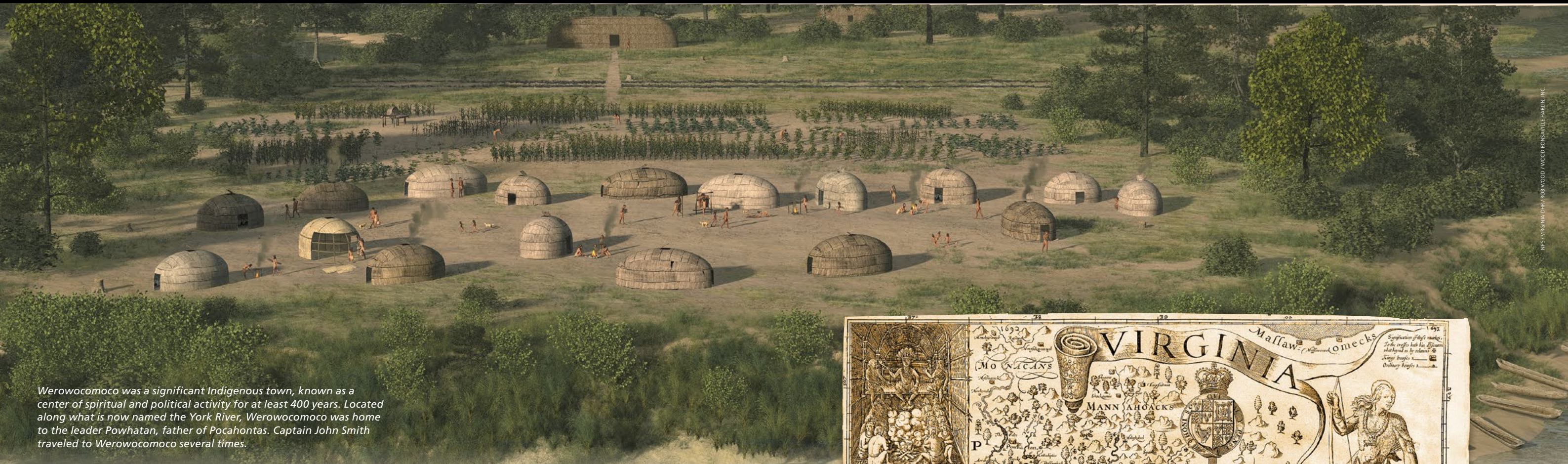
Werowocomoco was a significant Indigenous town, known as a center of spiritual and political activity for at least 400 years. Located along what is now named the York River, Werowocomoco was home to the leader Powhatan, father of Pocahontas. Captain John Smith traveled to Werowocomoco several times.