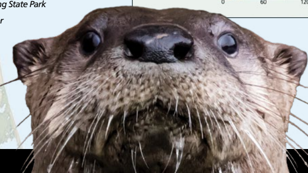
Cuitak or Rokayhook - Otter