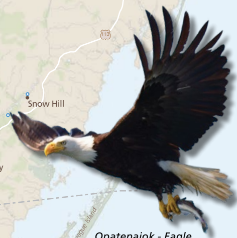
Opatenaiok - Eagle ATLANTIC OCEAN