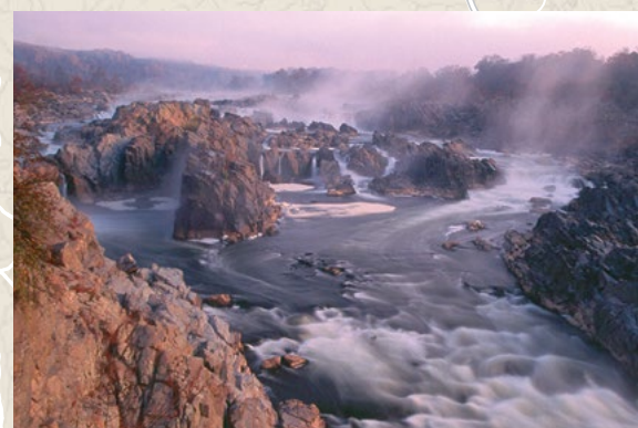
A dramatic view of Great Falls on the Potomac River.

Download the National Park Service app, a free mobile application that can be found through your device's app store. Use the app to discover National Park sites located near you. View interactive maps, tours of park places, on-the-ground accessibility information, and much more to plan your national park adventures before and during your trip.