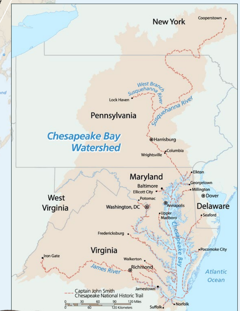
The Chesapeake Trail extends beyond the route of Smith's explorations to include additional river routes used by Indigenous peoples.