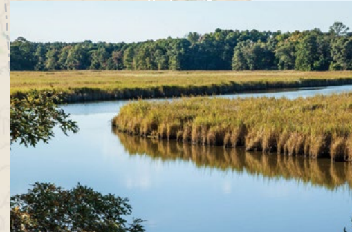
Meanders, or winding curves in a river's path, are among the Bay's visual charms.