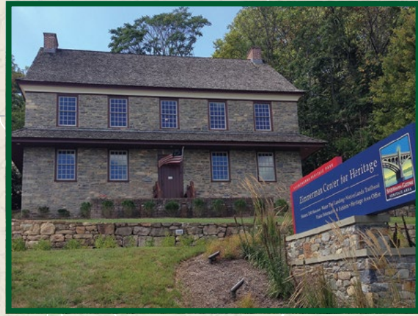
Trail Maryland and Susquehanna River access facilities are available at the Zimmerman Center for Heritage.