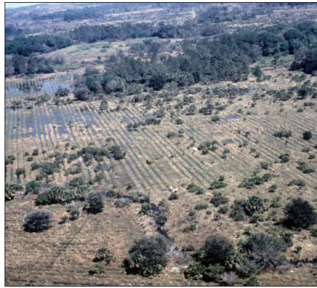
Nearly abandoned plowlines.

Into the mid-1900s, the Big Cypress Swamp and the Everglades were considered swampy wastelands by many. Efforts were made to “tame” the region – including the construction of roads, such as this one, canals to drain the swamp, and levees to control flooding. An aerial view of today's Preserve still shows evidence of farming attempts – some prairies have the tell-