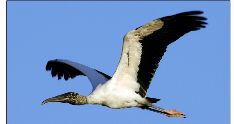
The locally endangered wood stork may often be spotted along Loop Road.

The midpoint of Loop Road is marked with signs. There is also another large culvert here with alligator flag. You know what that means: keep an eye out for alligators!