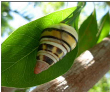
Liguus tree snails are a special sight throughout this area.

The Loop Road Education Center is operated by Everglades National Park for educational groups with reservations. Across the street on the north side, the Tree Snail Hammock Trail is maintained by Big Cypress National