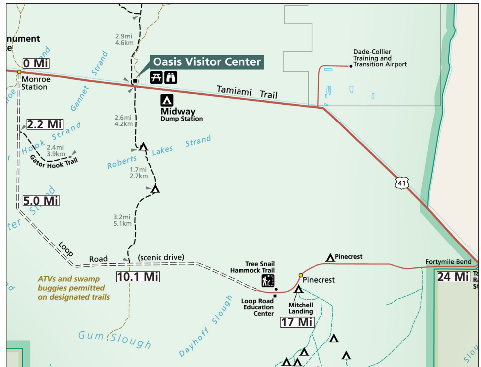
Map of the Loop Road Scenic Drive starting from the intersection of Hwy 41 and Loop Road at Monroe Station. Mileages are indicated in a counter clockwise pattern.

Four miles west of Oasis Visitor Center, or 15 miles east of the Big Cypress Swamp Welcome Center, Monroe Station is one of the original buildings along Tamiami Trail. Completed in 1928, or 1929, as one of six service stations built at regular intervals along the road to assist travelers - providing gasoline, refreshments, and assistance for broken-down vehicles. In later years, it was also a tavern and roadside inn. The historic building has stood through many eras and is now closed due to structural problems. It marks the northwestern end of Loop Road, and today is used as a parking area for off-road vehicles. There are off-road vehicle trails here that go both north and southwest into the Big Cypress backcountry. These trails are primarily for the use of all-terrain vehicles and swamp buggies – vehicles often built by their owners and specially