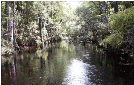
Sweetwater Strand is a popular spot along Loop Road.

The large trees provide a wind-break and shelter to many other organisms. Feel how the air is cooler, and moist? There is usually wildlife as well – both alligators and birds know this is a good source of fish, and the branches above