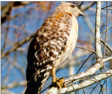
Red-shouldered hawk surveying the area for its next meal.

Look east to see a sawgrass prairie, with a cypress strand visible beyond. The sawgrass is a dominant prairie species, but ironically it is not grass, it is sedge. Prairies are flooded for less time out of the year, on average, than the slightly lower regions which have cypress trees. Every inch of elevation change counts in the Preserve. These open regions are often good spots to search for raptors, birds of prey that tend to perch in prominent locations such as atop standing dead trees. Drive another mile for a second sawgrass prairie.