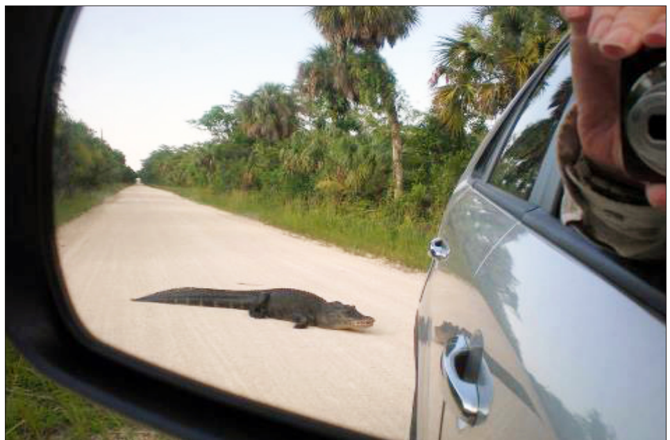
Remember, the Preserve is their home and you are the guest. Respect wildlife and observe from a safe distance.