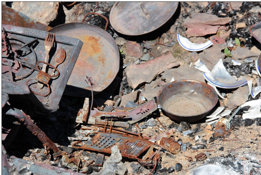
Trash from a historic trapper cabin was exposed after the Reynolds Fire burned the surrounding vegetation.

Think about your home. You probably have tools or toys or other things scattered around your house. How about your trashcan? Scraps there would tell interested investigators a great deal about your diet and habits. If viewed 100 years from now, your trash would tell tales of your daily life. Archeologists are essentially investigators of life. They strive to find all the evidence they can to create as complete a picture as possible. Within the burnt remains of the Reynolds Fire, before new vegetation grows in the nutrient-rich soil and obscures these sites, archeologists get to study and piece together lives from