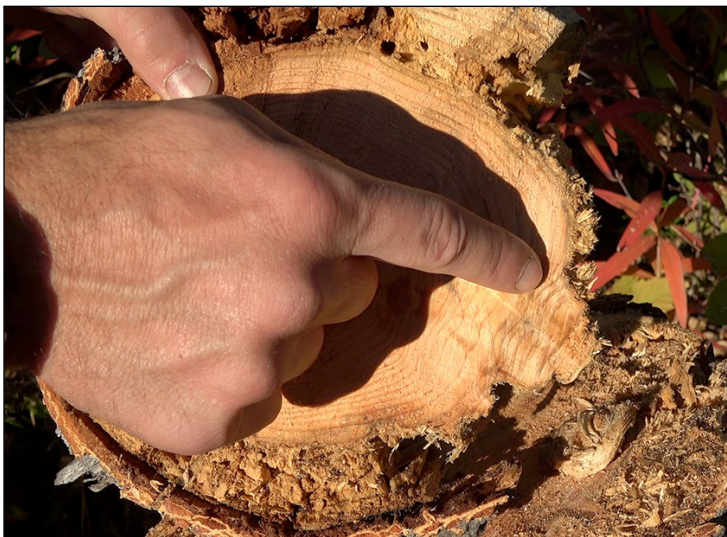
Many trees survive an avalanche with only scarring on their trunks. These scars are recorded in the tree's rings just as a fire leaves a charred area.

Pacific Ocean drops feet of snow on top of this existing weak layer, triggering major avalanches. Scientists are still studying exactly how climate change will affect these broader climate patterns (teleconnections), but any variations are likely to affect local weather patterns and thus avalanche behavior. For example, a shifting Arctic Oscillation that results in fewer cold snaps would mean a lower chance of surface-hoar formation (and associated weak layers), perhaps decreasing the number of slides we see. Conversely, changes in the PDO might make the Pacific storms stronger or more numerous, increasing the potential for major avalanches. These connections are incredibly complicated, and their effects on snowpack are not straightforward. As Peitzsch explains, "That's where it gets complex. . . the interaction of fewer cold spells and warmer storms. Will we see more avalanches or will we actually see less avalanche activity? That's what we're trying to figure out now." The multifaceted nature of these questions underscores the