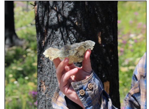
This crystallized-looking rock is actually the remains of the Baring Creek Cabin windows.

lized rock. “So this is what happens in a really hot fire. This is what the windows to the Baring Creek Cabin now look like... It depends on what type of glass it is as to what temperature it melts. This was burned at... maybe even as high as 1800 degrees.” The fact fuel was cached in the cabin