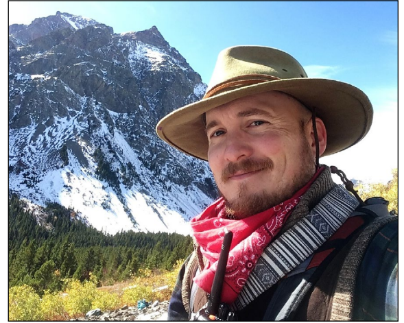
Nelson stops to take a selfie while leading a citizen science student group.

The birds at this particular lake are extremely sensitive to disturbance, which is why we have chosen to survey them without volunteer citizen scientists today. But typically, our goal at the Crown of the Continent Research Learning Center is to train volunteers to conduct loon surveys on their own. Citizen scientists receive the skills they need through an all-day training session and are provided access to our field equipment (spotting scopes, GPS, maps, and radios). They select from lakes that need to be surveyed and schedule site visits with us, so we can assure that all priority lakes are visited. Our goal is to monitor nesting attempts and record how many loon chicks survive each year. This year, four chicks fledged within the park, a number consistent with the annual average of 4–6 chicks.