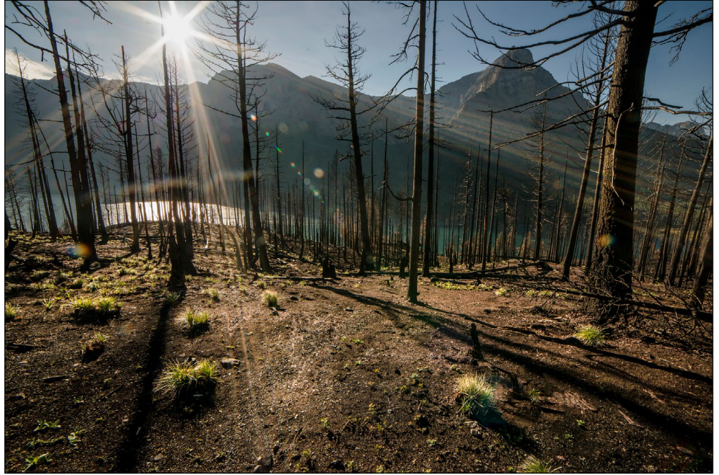
The Reynolds Creek Fire started on July 21, 2015. It grew and consumed the forest on both sides of the Going-to-the-Sun Road, leaving behind a new landscape and new archeological finds.

Fire is one of the most useful natural disturbances for uncovering historic sites and artifacts, especially in a highly vegetated area like Glacier. The Reynolds Fire did not disappoint. Once burned, the forest allowed researchers to see many hidden sites. And yet, if you were to stumble upon one of these locations, it would look more like an old trash pile than a place for archeological study. Brent Rowley and Kyle Langley do not agree. As the saying goes, “one man’s trash is another man’s treasure.” Rowley and Langley are seasonal archeologists at Glacier National Park. Following the