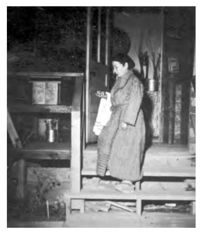
Woman en route to the shower at the Minidoka Relocation Center in Idaho.

critical role in the way Asian Americans and Pacific Islanders (AAPI) have responded to the demands to conform. The first Asians to set foot on U.S. soil came to visit and learn from the U.S. educational system, yet the pioneers were sojourning laborers whose presence grew as the economic need for their labor increased. Economic necessity pulled the migrant workers, but their existence in everyday life threatened the European migrants' claim to land and power. There are key social-political factors that impacted cultural spaces for AAPIs. This essay contextualizes assimilation and resistance through a historical-social lens. Utilizing the primary research from Asian American Society (Danico, 2015), I examine the ways in which the labor market sparked the influx of Asian Americans; when access to rights became unattainable, AAPIs had to negotiate assimilating in a place that did not want them as permanent settlers even as they fought to secure a place in the society and to help shape the U.S. landscape. While the economic influence has always been significant, what has become more noticeable in the contemporary world are the cultural landscapes and the roles that AAPIs have played in shaping America through the arts, media, and social activism.