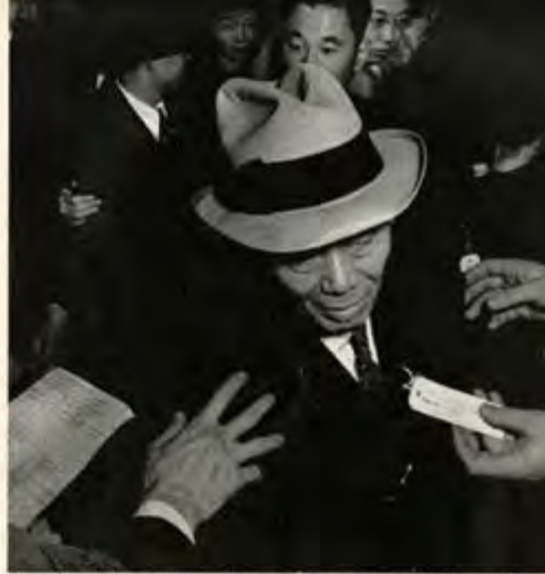
Over 100,000 residents of Japanese ancestry like these have been taken from homes and jobs without trial or hearing, put in detention camps. Seven out of every 11 are American citizens.