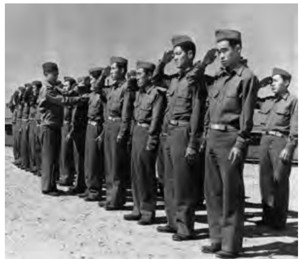
A company officer of the 442nd Combat Team corrects the saluting technique of a rookie from Hawai‘i in June 1943. The unit began training with remarkable speed after its arrival at Camp Shelby in Mississippi.

Military service became a tangible means to express support for both the U.S. and the home country. This held particular resonance for Chinese, Filipino, and Okinawan Americans, who in some cases, fought in battles that directly impacted their home countries. Twelve thousand to 15,000 Chinese Americans, about 20 percent of all Chinese American men, served in the armed forces in both segregated and non-segregated contexts. The largest segregated unit was the 14 th Air Service Group, which included about 10 percent of all Chinese Americans who served. Made up largely of immigrants, the 14 th ASG was sent to China, where it serviced airplanes and did other support work over the course of the war. Many Chinese Americans from Hawai‘i served in Europe in some of the heaviest fighting of the war. 34 Although Filipino Americans were initially banned from military service due to their status as “nationals”, as opposed to aliens or citizens, they fought to have that