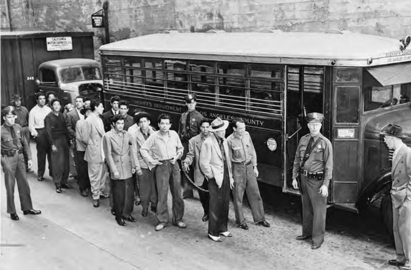
Zoot suiters lined up outside the Los Angeles jail, en route to court after a feud with sailors, June 9, 1943.

the largely ethnic minority men who wore them. 49 Early Japanese American returnees to the west coast often faced a hostile reception, with dozens of terrorist incidents reported, including shots fired into houses and the torching of Japanese American properties. 50 Senator Daniel Inouye, a war hero who lost an arm in combat in Europe, often told a story of walking into a barbershop in Oakland, in full uniform with three rows of ribbons, only to be told by the barber, “We don’t cut Jap hair.” 51 Even Chinese Americans, who had benefited from the positive image enjoyed by China in the 30s and 40s, would suddenly become suspect themselves when the 1949 Chinese Revolution saw the Chinese Communist Party come into power.