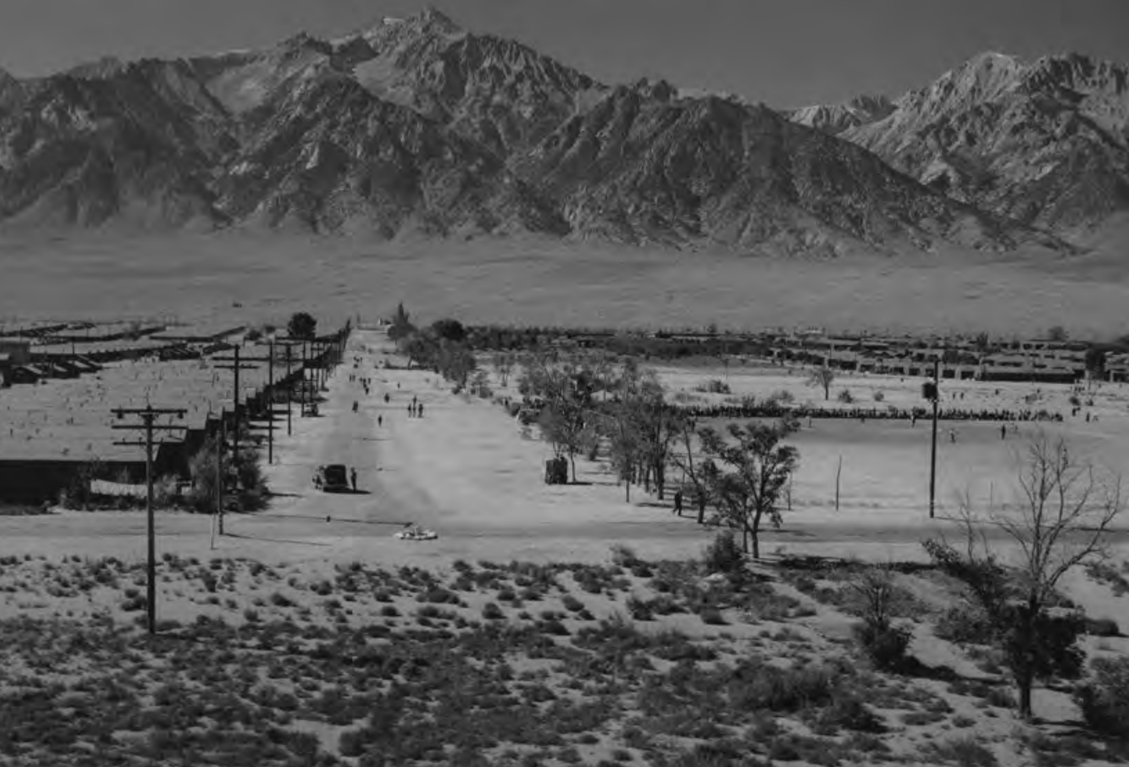
Bird's-eye view of the grounds of Manzanar from the guard tower in 1943. The view west shows buildings, roads, and the Sierra Nevada Mountains in the background.

the inmates into “loyal” and “disloyal” categories. The former would be encouraged to leave the camps for “resettlement” in parts of the country away from the still off-limits west coast or to join the army; the latter would be segregated at a separate camp for the duration of the war so as not to be a bad influence on the “loyal.” The mechanism for this determination was a clumsily worded and administered questionnaire that all inmates over the age of 17 were required to fill out. On the basis of answers to two questions—one concerning willingness to serve the U.S. on combat duty or in other ways for women, the other asking individuals if they could swear allegiance to the U.S. and forswear allegiance to the Japanese emperor—“loyalty” would be determined, with anything other than unqualified “yes” answers to both constituting “disloyal” status. As might be expected, asking such questions to a diverse population imprisoned in concentration camps led to many unintended