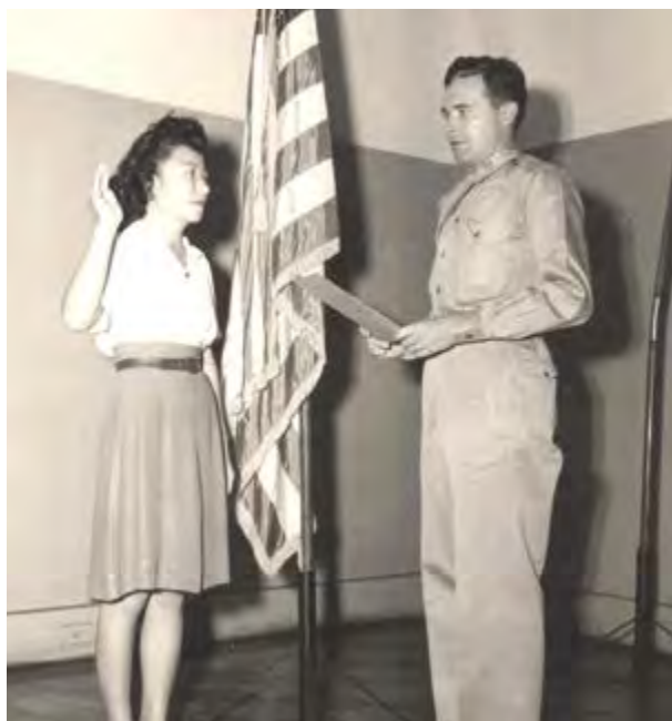
A Chinese American WAC is taking the oath for service.

Meanwhile, the WRA pushed ahead with the release of “loyal” inmates. There were two precursors of these releases. Starting the fall of 1942, thousands of Japanese Americans were given short-term leave to help to alleviate labor shortages in agricultural areas. Over 8,000 Japanese Americans left the camps to pick sugar beets and other crops, mostly in states in the near west, such as Idaho, Colorado, and Utah, along with the eastern portions of Washington and Oregon. 26 A similar effort took place in the fall of 1943. Some Japanese Americans who left on agricultural leave were able to settle in these areas and reestablish themselves as farmers. Also starting in the summer of 1942 was a private program that helped Nisei resume or start their college educations. The National Japanese American Student Relocation Council eventually placed more than 4,000 Japanese American