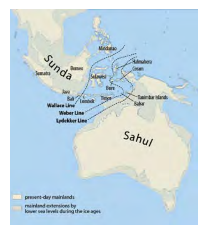
Map of Sunda and Sahul. Made by Maximilian Dörrbecker (Chumwa) for Wikimedia Commons, 2007.

I. The modern landmasses of Australia, Tasmania, and New Guinea were settled between 30,000 and 60,000 years ago, as people moved from mainland Sunda (a continental landmass covering the present-day Malaysian peninsula and the islands of western Indonesia) across a now-submerged land bridge into the Pleistocene-era continent of Sahul (a connected landmass