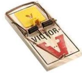
Figure 1. Image of a snap trap. Note the large yellow square, or expanded trigger.

Always! Snap traps are both a monitoring tool and a removal tool; they help alert you to rodent activity and reduce contamination by killing rodent before they do too much damage. Snap traps have been proven to be the most effective method of trapping rodents indoors, and are also considered the safest for both humans and non-target wildlife. Keep them set year-round!