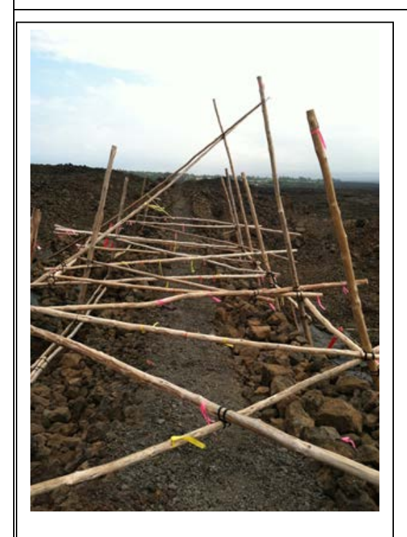
Olokea (traditional ladder system) spans worksite of Kiholo Puako trail.

Continuing the legacy of building and caring for trails practiced in this area for generations by the families of Pu`uanahulu and Pu`uwa`awa`a, damaged sections of the Kiholo-Puako Trail were repaired during the summer months of 2013. The damage to the trail section between Kiholo and Puako was caused by the earthquake of 2006. This work is being done through a partnership between Hawaii State Na Ala Hele Trail Access Program, State Parks, Hui Aloha Kiholo and the National Park Service with many community volunteers. This trail is one of many in the network of ancient and historic trails that make up Ala Kahakai National Historic Trail.