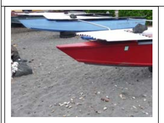
Opelu canoes at Hookena beach

The small village of Ho`okena continues to show the strength of their community especially over the last year with a renewed involvement with Ala Kahakai NHT. In December of 2012, they hosted a Music and Talk Story. Their choice was to focus on their youth by telling the stories of the long standing tradition of opelu fishing and letting them participate with hands on learning. With the young people on board, they were taken out on the ocean by the kupuna of the area and were put to work. Lucky visitors who happened by were allowed to observe the same activities from the canoes that were launched into the bay throughout the morning. The harvest was shared with anyone who wanted to try fresh opelu. Besides the community displays of historic