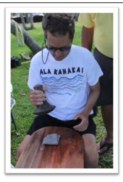
Ala Kahakai Trail Association board members pound kalo into poi.