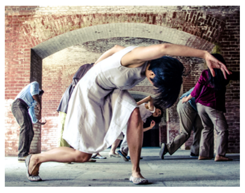
Double Victory performing arts event at Fort Point National Historic Site in San Francisco.

Certified Local Government Program www.nps.gov/clg/