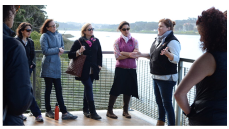
12 Learning about ParkRx programming and partnerships in the Bay Area.

Office of Public Health Healthy Parks Healthy People National Program www.nps.gov/public_health/hp/hphp.htm