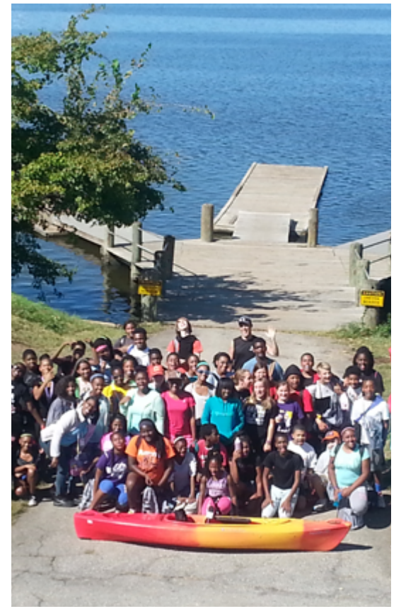
Kids in Kayaks program offered in partnership with Baltimore National Heritage Area.

These national and regional opportunities are open primarily to youth (ages 15 - 35). Most of these opportunities are offered in collaboration with youth organizations.