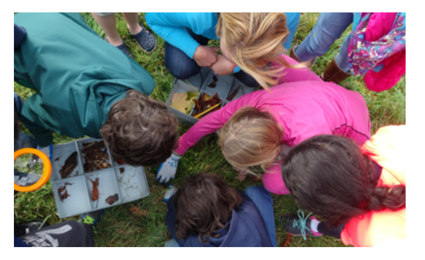
Boston Public School students investigating the hayfield ecosystem at Adams National Historical Park with the Olmsted Center for Landscape Preservation.

There are 18 RLCs across the U.S., each of which serves a park or regional network of parks. Most are physical places with laboratories, work spaces, and housing for researchers and students. Others are virtual and consist of web