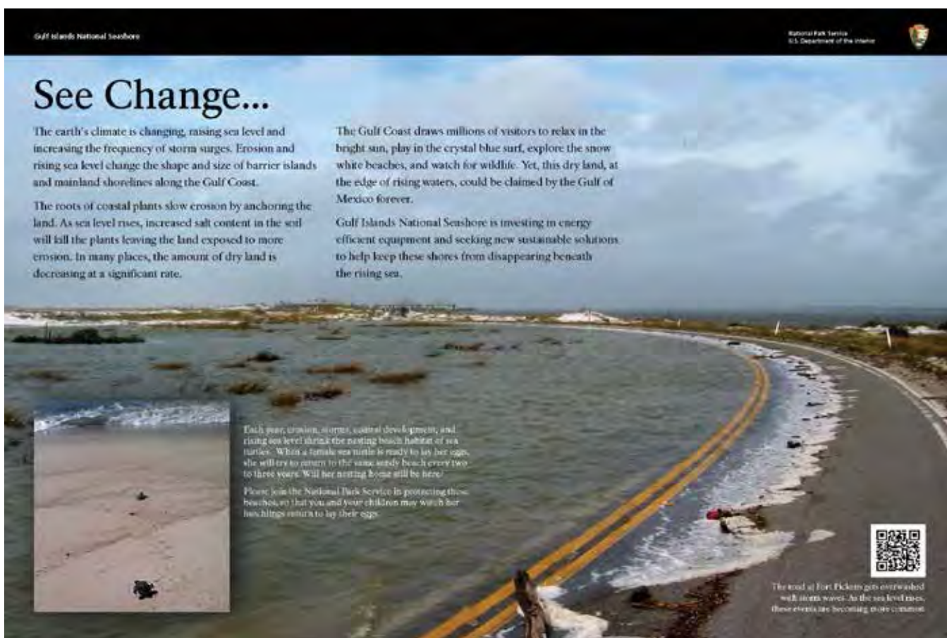
A wayside explaining sea level rise. This wayside is one of two that were installed at Gulf Islands National Seashore in 2015.

Three parks will also be selected for funding to install waysides highlighting the issue of sea level change. Gulf Islands National Seashore has been selected as the first park to receive funding, which they have used to install two waysides explaining the challenges of rising sea levels along the Gulf of Mexico coast.