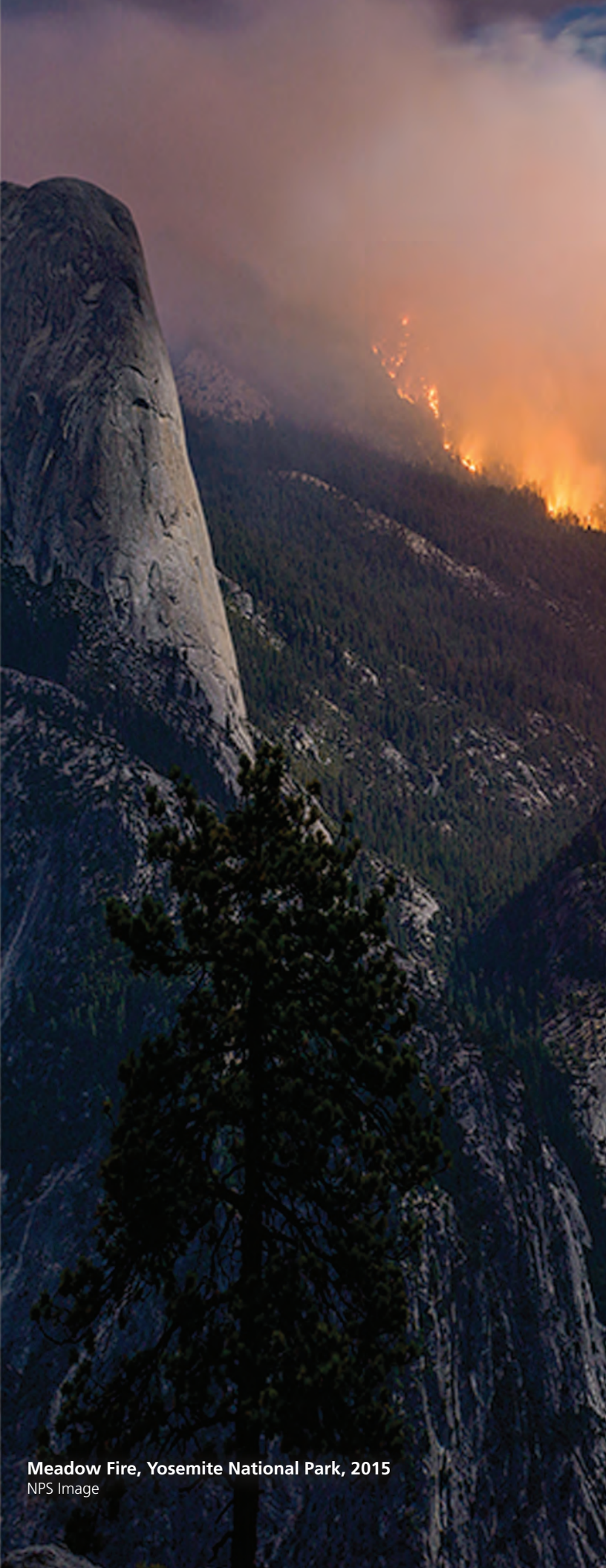
Half Dome, Yosemite National Park, 1867 NPS Image