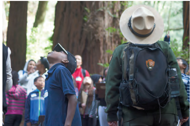
Students search for personal relevance in Muir Woods National Monument.

People relate to their national parks in deeply emotional ways. Through the meaningful stories they relate, America's national parks have a unique power to connect individuals to our nation's heritage. By using these natural laboratories and classrooms to reach the hearts and minds of staff and visitors, we can provide opportunities to engage emotionally and intellectually with climate change and learn from one another. Fostering these connections is fundamental to nurturing the personal relevance necessary for individuals to be fully informed citizens.