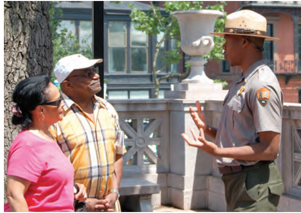
National Park Service rangers earn trust from visitors.

The NPS is a globally trusted source of informal education. As such, we are uniquely positioned to engage all audiences on climate change impacts to our national parks, possible adaptations to changing conditions, and mitigating our carbon footprint. Furthermore, we are well-poised to model the behaviors and actions conducive to addressing climate change. Effective interpretation and education is essential for the NPS to maintain and enhance our institutional influence and continue to lead in the face of this unprecedented challenge.