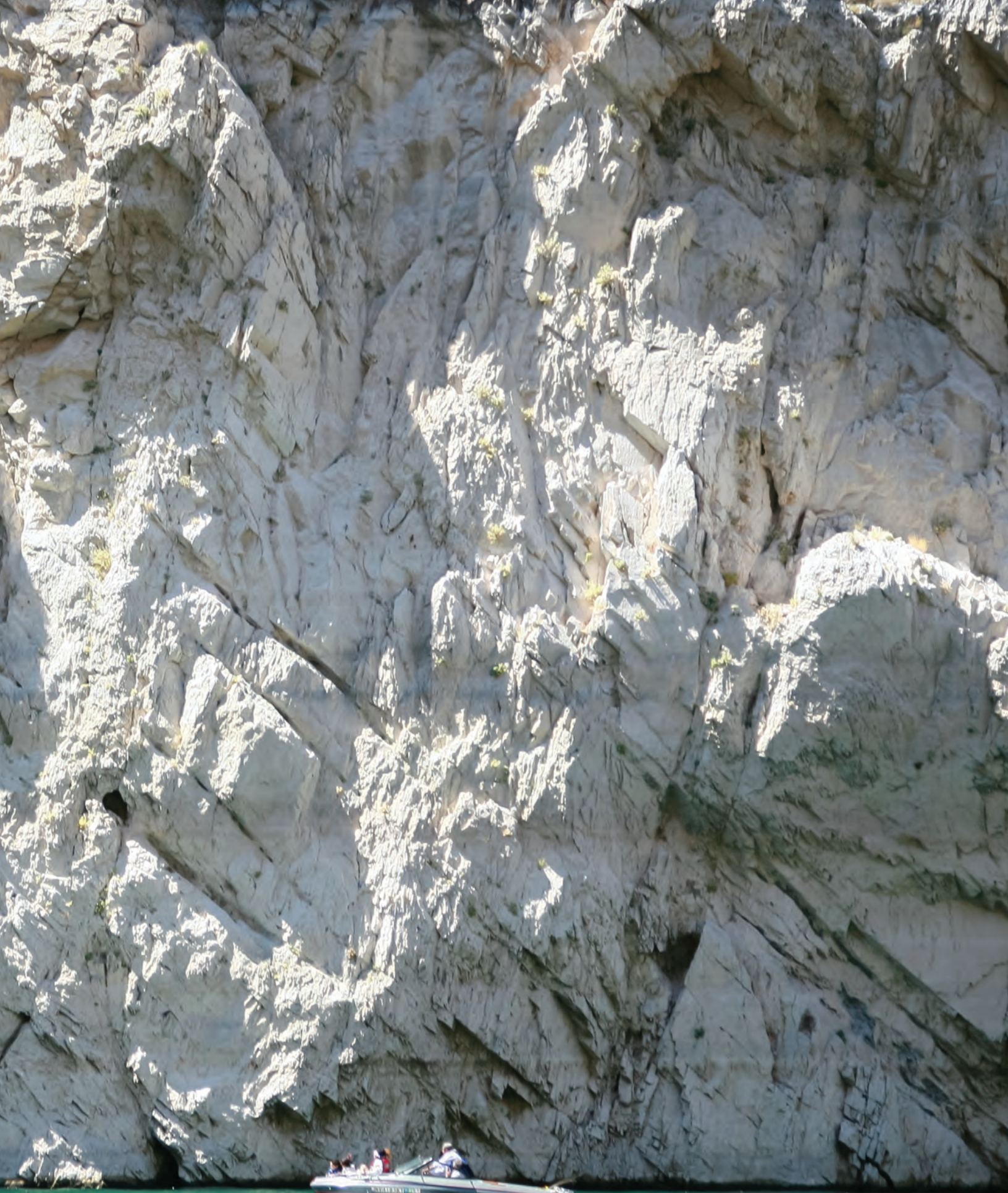
The southwestern U.S. has seen decreases in spring snow pack contributing to water scarcity. (Melilo et al 2014) The stark white walls encountered at Lake Mead National Recreation Area dramatically illustrate falling water levels resulting from a combination of climate change and urban and agricultural water use. (Barnett and Pierce 2008, Dawadi and Ahmad 2012)