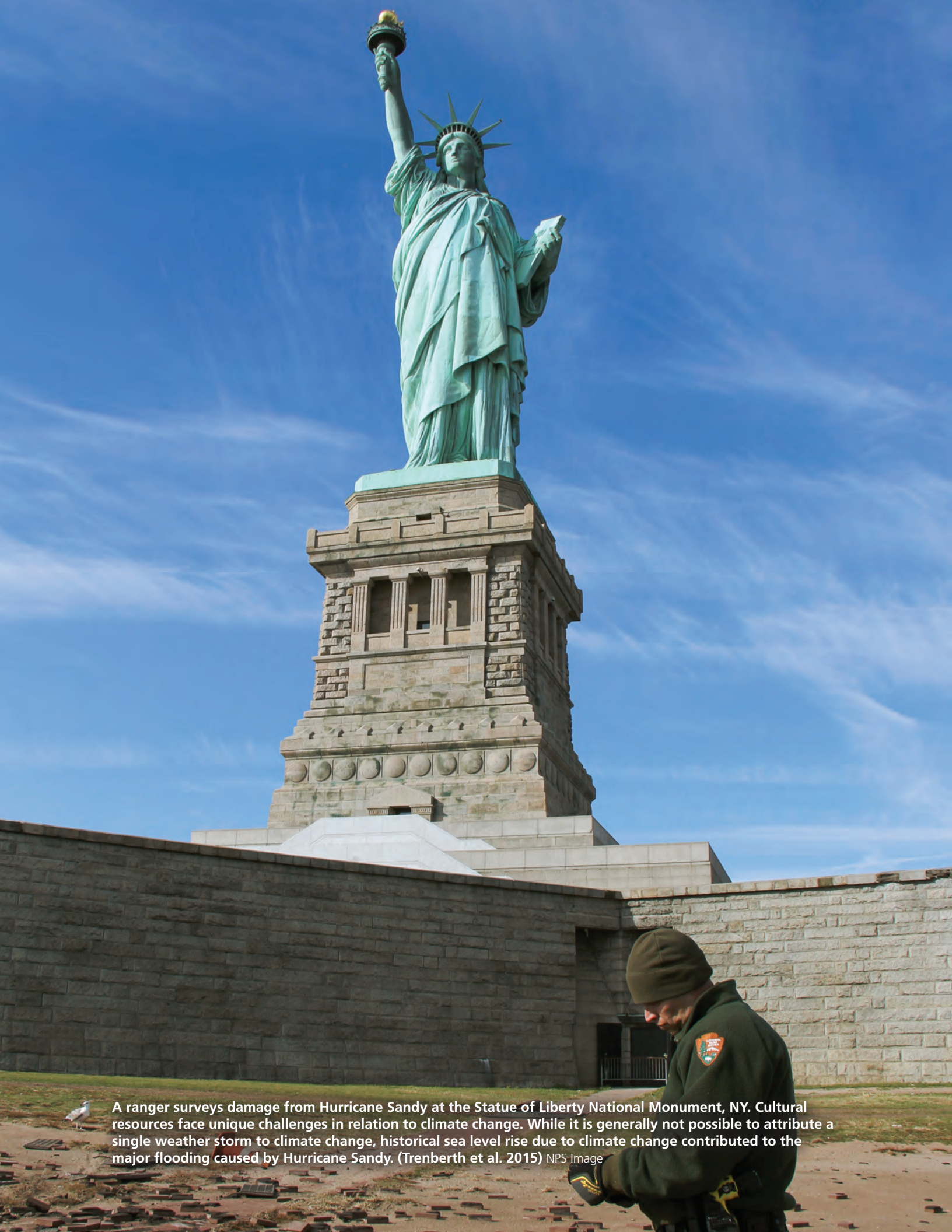
A ranger surveys damage from Hurricane Sandy at the Statue of Liberty National Monument, NY. Cultural resources face unique challenges in relation to climate change. While it is generally not possible to attribute a single weather storm to climate change, historical sea level rise due to climate change contributed to the major flooding caused by Hurricane Sandy. (Trenberth et al. 2015)