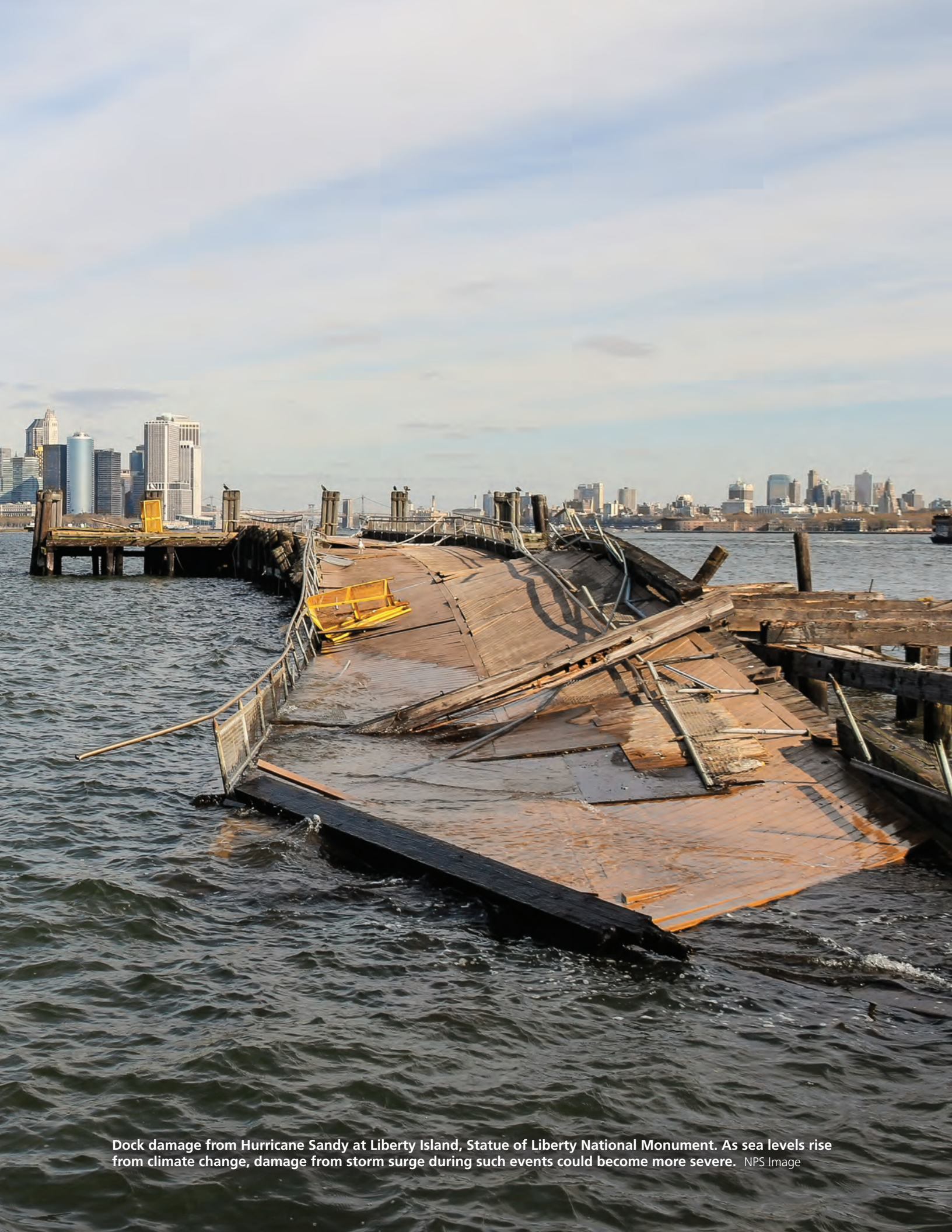
Dock damage from Hurricane Sandy at Liberty Island, Statue of Liberty National Monument. As sea levels rise from climate change, damage from storm surge during such events could become more severe.