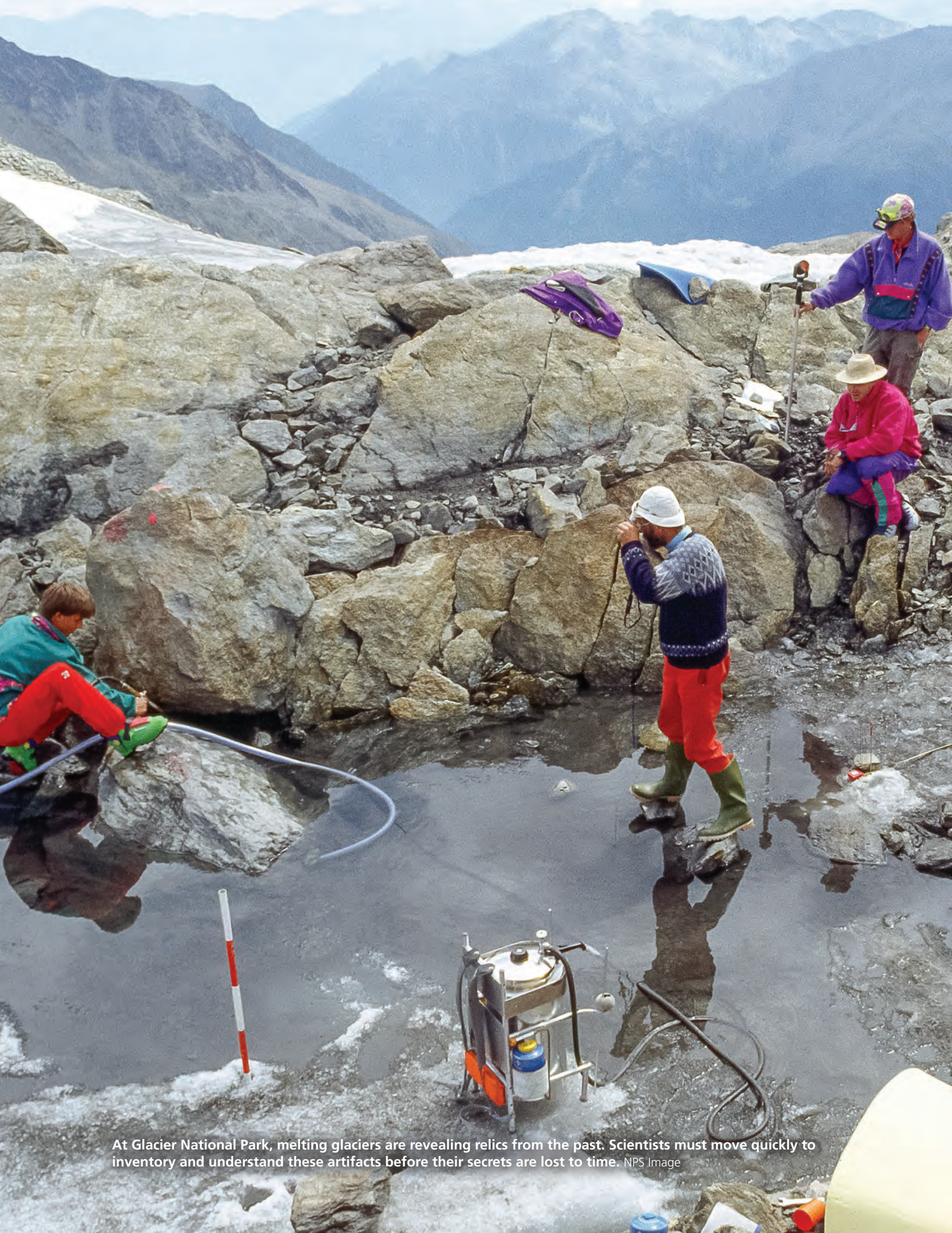
At Glacier National Park, melting glaciers are revealing relics from the past. Scientists must move quickly to inventory and understand these artifacts before their secrets are lost to time.