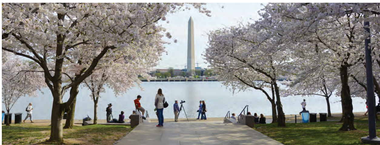
Visitors to the Tidal Basin at East Potomac Park.

As places where visitors can witness and experience the impacts of climate change in a place they know and love, parks have extraordinary and unique potential for communicating climate change. This devotion to such special places allows individuals to find their own personal relevance to climate change and to engage others to find their own connection to climate change.