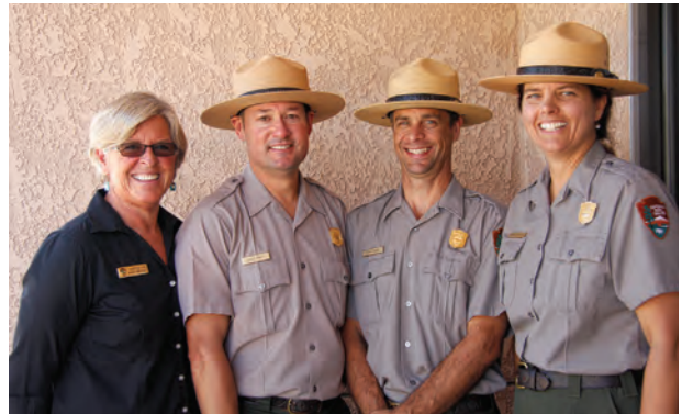
National Park Service Rangers

Communicating about climate change can be an empowering act for NPS staff and partners. National parks serve as ideal venues for civic engagement, and NPS interpreters and educators hold an exceptional position with audiences as trained, trustworthy sources willing to engage the public. Furthermore, guidance on best practices and appropriate techniques can help individuals foster the skills necessary to create meaningful and relevant climate change programming.