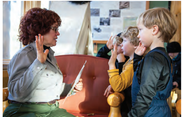
National Park Service ranger with the next generation NPS Image

Meeting the challenge of global climate change will require an unprecedented level of collaboration and cooperation beyond single parks or the National Park System. Working with local communities, government agencies, volunteer networks, concessioners, educational partners, and partner organizations will increase the scope and efficacy of communication efforts. NPS interpreters and educators serve as the ambassadors for community-based efforts and can assist in developing and providing consistent messaging and educational standards, as well as exemplifying climate-friendly behaviors.