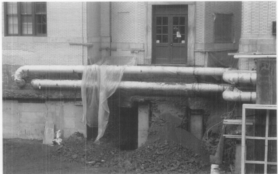
Figure 3. Concrete pier underpinning to an existing building may be necessary when adjacent construction occurs. In this example, pits are hand dug beneath the foundation of the historic building to provide space for wood forms. After concrete is poured into the forms, the space between the top of the pier and the bottom of the original foundation is packed with a quicksetting grout. The historic building owner should retain an independent engineer to ensure that the underpinning plan adequately protects the historic structure.

Construction site runoff from cement mixing and cleaning and dust suppression activities should not flow toward the historic property. Although placing screens and wire cages over exposed areas of the drainage system may provide some protection from obstructions, such installations need to be inspected just as frequently. Low-pressure water washes can occasionally be used to flush the system of dirt and debris. To reduce the possibility that drainpipes will be blocked at the adjacent construction site, all concealed pipes should be traced from their origins at the historic structure and the