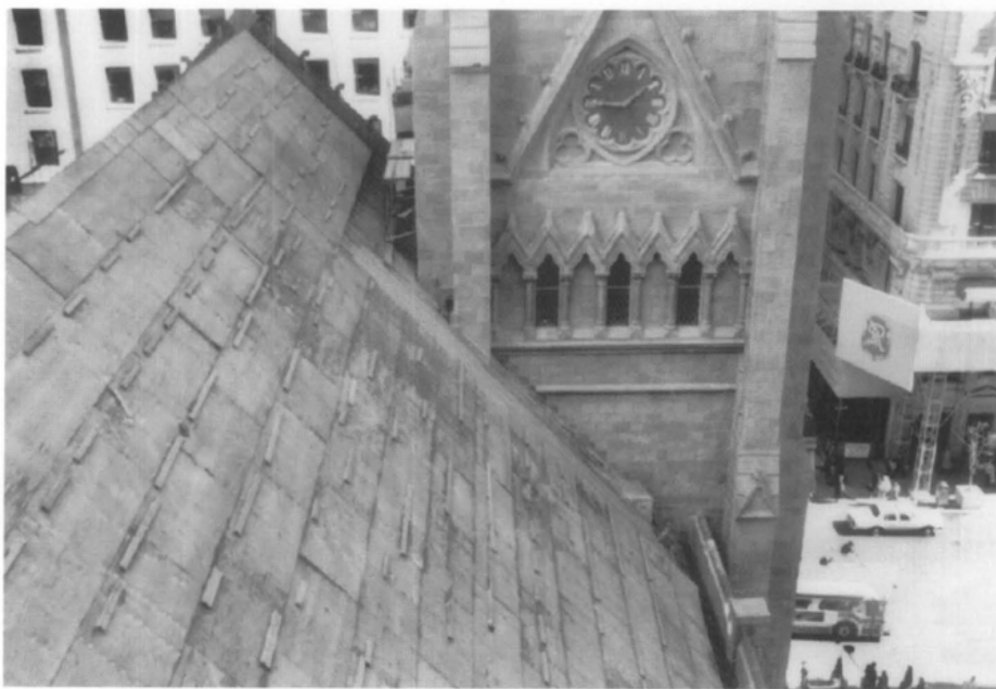
Figure 4. Dropped equipment, tools, and materials all present risks when new construction rises above neighboring historic structures. In this case, the historic slate roof was completely covered with sheets of exterior grade plywood.

Other byproducts of new construction and demolition, such as dirt and dust, can also pose threats to an adjacent historic structure. Dust suppression measures including the installation of fabric enclosure systems should first be employed at the building site (see figure 5). Despite these efforts, historic building owners will undoubtedly have to deal with raised levels of dust infiltration. Accordingly, vulnerable interi-