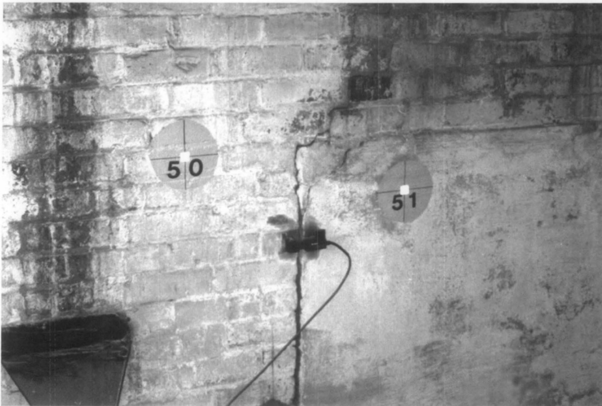
Figure 7. Electronic crack monitor and survey targets are shown installed on an existing wall. The crack monitor feeds movement data to a laptop computer. The targets are aligned and measured with optical survey equipment to determine the degree and direction of movement.

Protecting a historic building from adjacent construction or demolition activity requires thoughtful planning and cooperation between the developer and the historic property owner. Thorough pre-construction documentation of the historic structure ensures a common understanding of present conditions and suggests appropriate damage prevention measures that can be taken at both the historic site and the construction site. A routine program of visual inspection and vibration and movement monitoring helps insure early detection of the effects neighboring construction work is having on the historic building. Early consideration of these issues, before damage takes place or worsens, can allow for the adoption of safeguards that protect the developer's schedule and budget and the physical integrity of the historic structure.