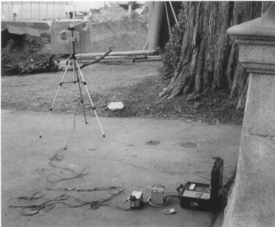
Figure 6. A seismograph records vibrations transmitted at the ground level of an historic building. The instrument is wired to a light and siren designed to warn the excavation crew that vibration levels are approaching preset limits. Additional sensors are often installed in the basement and on sensitive features such as stained glass windows.

each visual inspection. Such a systematic written record may also prove useful if disputes arise over the timing of and responsibility for damage.