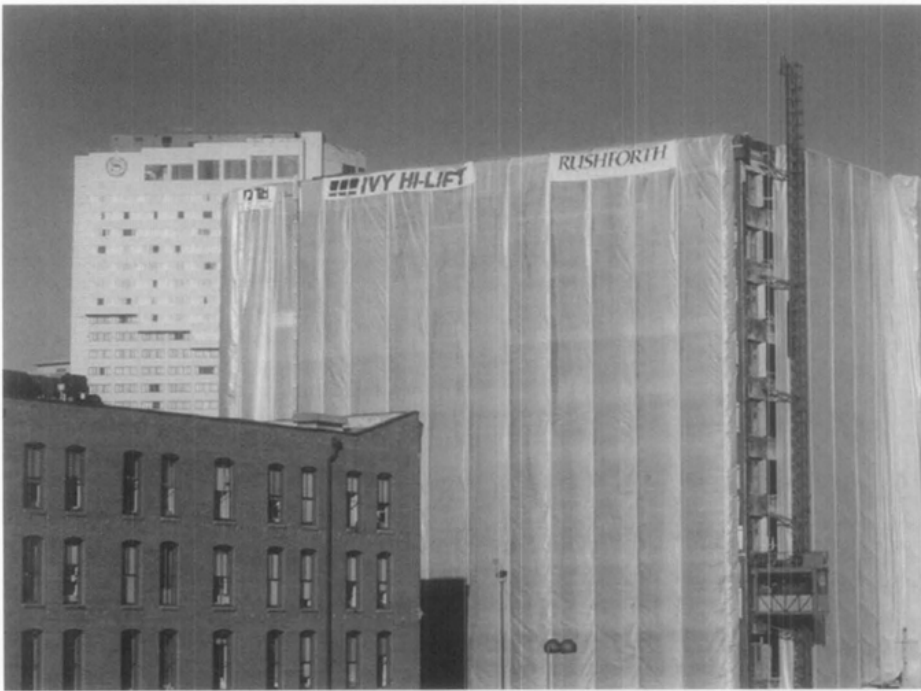
Figure 5. The historic building on the left is partially protected from debris and dust generated by the renovation of the structure to the right. Such temporary enclosure systems consist of a polyethylene or other fabric shell stretched between an aluminum frame.

or objects and artifacts should be covered or temporarily moved to another location. Windows can be taped shut or temporarily sealed with clear polyethylene sheets. Additional mats or carpets near entrances can help reduce the amount of dirt tracked inside. An accelerated maintenance program that includes thorough and frequent cleaning and HVAC filter replacement, is an effective means of addressing the degraded environment surrounding a construction site. To lessen the chance of airborne asbestos infiltration, the exhaust from sealed work areas must be properly filtered and vented away from historic buildings.