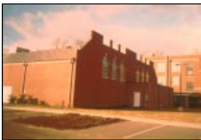
This 1930 school was rehabilitated for use as elderly housing.

Application 3 ( Compatible treatment, retention of character of gymnasium ): When another, early-twentieth century school building was rehabilitated for use as senior housing, primary character-defining features were preserved in the classrooms. Part of its gymnasium was also adapted for apartments. Two rows of apartments were created on two sides of the gymnasium leaving the center section with its full height and exposed truss system clearly visible as an atrium-like, open space. Like the previous example, by converting only a portion of the gymnasium to apartments, enough of the gymnasium was retained intact so that its essential character and spatial volume were still apparent.