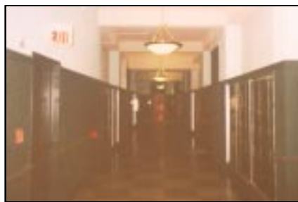
Character-defining features were retained in the corridors and former classrooms.