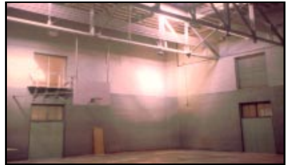
One-third of the gymnasium was converted into four apartments by adding a second floor. The remaining full-height portion of the gym was retained as a gallery space.

Application 3 ( Compatible treatment, retention of character of gymnasium ): When another, early-twentieth century school building was rehabilitated for use as senior housing, primary character-defining features were preserved in the classrooms. Part of its gymnasium was also adapted for apartments. Two rows of apartments were created on two sides of the gymnasium leaving the center section with its full height and exposed truss system clearly visible as an atrium-like, open space. Like the previous example, by converting only a portion of the gymnasium to apartments, enough of the gymnasium was retained intact so that its essential character and spatial volume were still apparent.