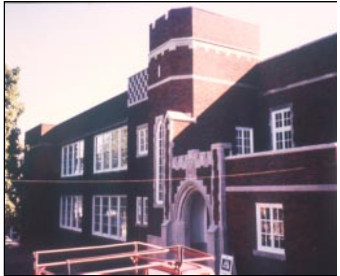
This 1925 high school annex was rehabilitated as residential/work units.

Application 2 ( Compatible treatment, retention of character of gymnasium ): A 1925 high school annex, which included a gymnasium, was also converted successfully into combined living/work units. The rehabilitation retained and repaired all significant features in the corridors, including decorative relief-plaster molding, door transoms and trim, flooring, ceiling height, lockers and staircases. In the classrooms, trim, flooring, and even blackboards—where extant—were also kept. Here, too, the combined live/work use worked in favor of maximum retention of the historic character-defining features and spaces in the school building. Approximately one-third of the gymnasium was reconfigured into four apartments—two on the first floor and two on a new second floor installed at the same level as the second floor classroom corridor. A pair of doors which had provided access to a no-longer extant balcony in the gymnasium was adapted as an entry to one of the second floor apartments, and a window was modified to create an entrance for the other. Two-thirds of the gymnasium was retained intact with its full height and truss system visible for use as a gallery space.