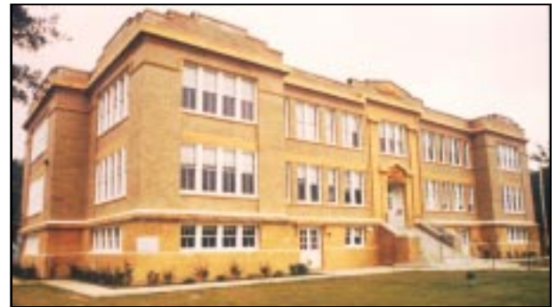
A derelict 1914 high school building was converted into residential/work studios for artists. All distinctive features and spaces were repaired and preserved in the corridors and in the classrooms. The auditorium was also retained virtually intact for use as an exhibition space for the resident artists.

Application 1 ( Compatible treatment, retention of character of auditorium ): This 1914 school building was rehabilitated as residence/work spaces for artists. Twenty-eight apartments were created out of former classrooms and the auditorium was retained, with very little change, as an exhibition space for the residents. Despite the extremely deteriorated condition of the interior of the school which had been vacant for years, all wood features were repaired, or replaced in kind, if necessary. These included: floors; staircases; windows; historic trim—doors, transoms, moldings, chair rails and picture rails, and wainscoting. Coved plaster ceilings, and even decorative radiators were retained throughout. The HVAC systems were installed discretely and, along with the sprinkler system, left exposed, which kept ceilings at their original height. The simple, industrial-style kitchen units containing the sink, counter top and shelving, and a minimum of new partitions also helped to preserve the character of the classroom spaces.