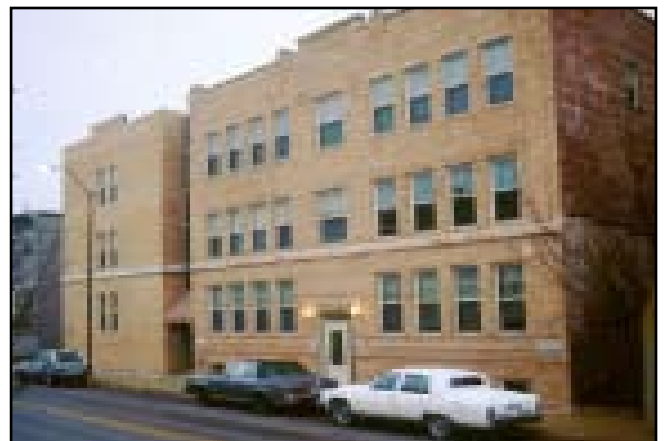
The slight recess at the intersection of the addition (left) and the historic facade (right) allows the visual mass of the original building to remain unchanged.

The successful intersection of old and new continues on the interior where the character of the former exterior wall is preserved. The brick surface remains punctuated by the original window openings that have simply been infilled with painted panels. The size, and details of the addition make it distinctly subordinate to the original building, and its placement avoids obscuring any character-defining features.