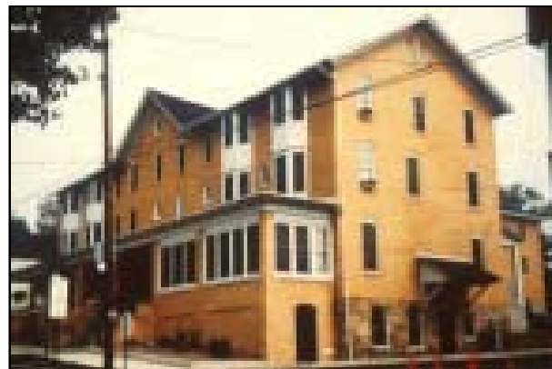
The new addition is not visible from the front of the building.