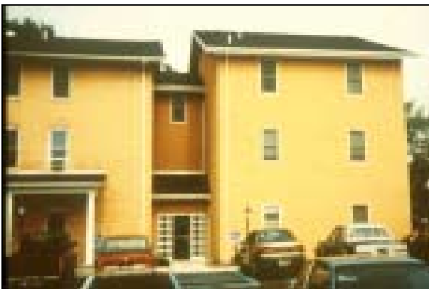
Rear of hotel showing original building (left), new addition and recessed connector.

Application 3 ( Compatible addition ): This small roadside hotel has been modified and expanded many times since its construction in 1853. The recent rehabilitation included another addition at the end of the rear wing. It is similar to the existing rear wing yet differentiated. Though the color is the same, the addition is stucco rather than brick. Windows are the same type and proportion, but the new ones have a simple lintel rather than a brick arch. The width of the addition and the slope of its roof match the rear wing but a small recessed connector separates the new from the old. The simplicity of the design and the location at the rear minimize the impact of this compatible addition.