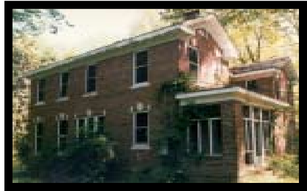
Shown is the side of the historic house illustrated in the elevation (below, left).

Application 2 ( Incompatible treatment, inappropriate addition ): This freestanding Colonial Revival style house was built in 1928 on a large site that remains somewhat wooded. The proposed addition has a footprint nearly twice the size of the original building, which is far too large to be offset even by its location at the rear of the house. There is little in terms of design or proposed materials to distinguish the new construction from the original house. In addition the architectural elaboration of the two new side entrances makes them strong elements that diminish the importance of existing character-defining features. The historic setting is also altered by so large an addition as well as the extensive paving for drives and parking lots.