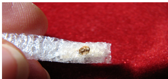
Figure 3: A foam stick with the object securely held in the desired position.

For the smallest specimens, a hot metal rod or wire may be used to melt a cavity of the proper size. The cavity should be small enough to gently hold the specimen with the diagnostic surface, such as the occlusal surface of a tooth, facing outwards (Fig. 3).