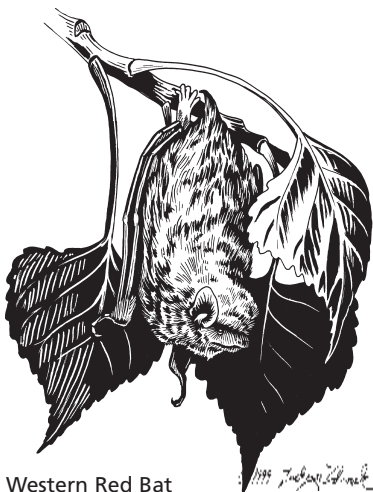
Western Red Bat