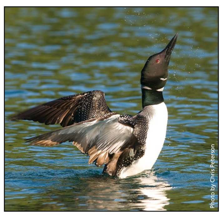
Common loons have a variety of calls and behaviors that indicate something is disturbing them. This adult loon is reacting to a perceived threat by doing a penguin dance, a display used when the bird feels severely threatened.

Common loons have specific habitat requirements—lakes over five acres in size, clear water, little disturbance, and a good supply of fish and/or aquatic invertebrates. They also have a low recruitment rate, only producing up to two chicks per mating pair each year, and are slow to mature—the average first year of successful breeding is seven years old.