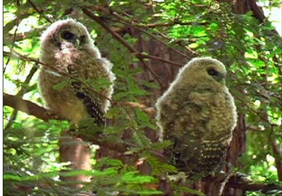
Spotted owl fledglings

(10 of 15) monitored in 2008. Pairs of spotted owls occupied 60% or 15 of the 25 long-term monitoring sites. In 2008, researchers also monitored for barred owls, one of the main threats to spotted owls. The number of known barred owls on federal lands in Marin County is currently three adults (a pair and a single male). No known barred owl nests occurred in Point Reves lands in 2008; however, a pair successfully fledged two young at Muir Woods.