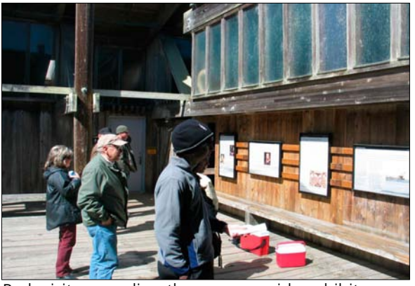
Park visitors reading the new wayside exhibits on Sir Francis Drake at the Drakes Beach courtyard