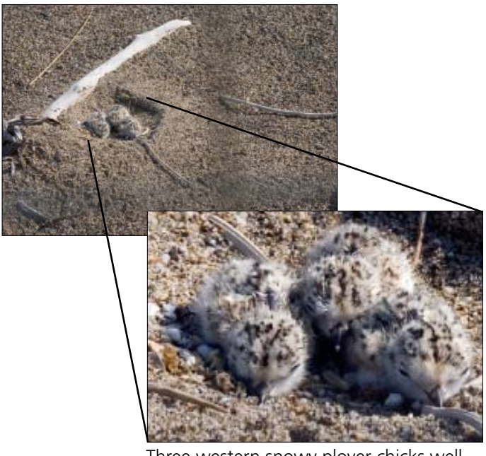
Three western snowy plover chicks well camouflaged on the nest

In 2009, the Seashore will continue to monitor and protect plovers, and restore habitat. In addition, the program will develop a formal monitoring protocol for the Seashore, following national standards. Most important is a planned 300+ acre coastal dune restoration project that is proposed to start in 2009. This large project likely will substantially improve the plovers chances for avoiding predators and disturbance from park visitors.