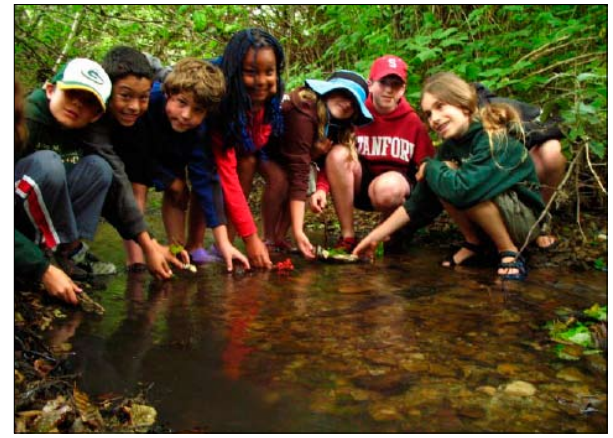
Some of the children who participated in Summer Camp last year