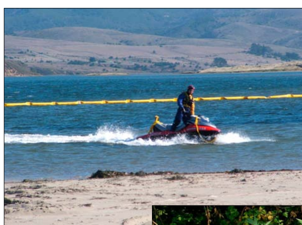
NPS Ranger deploying boom during Cosco Busan oil spill and marijuana plot

The Special Park Uses Branch was busy this year with reissuing several ranch permits and with issuing a new Concession contract for the Stewart Horse Camp. Four of the concession operations underwent an environmental audit, which will help them in running their business's in a more eco-friendly manner.