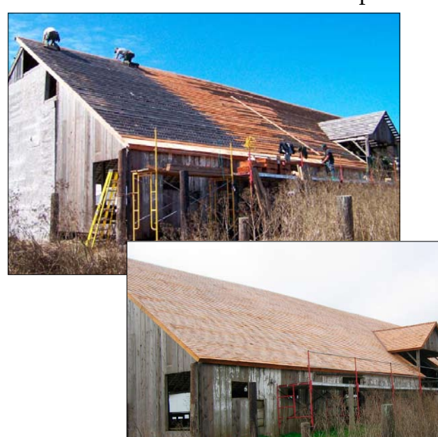
Stabilization of roof at the D Ranch Milking Barn