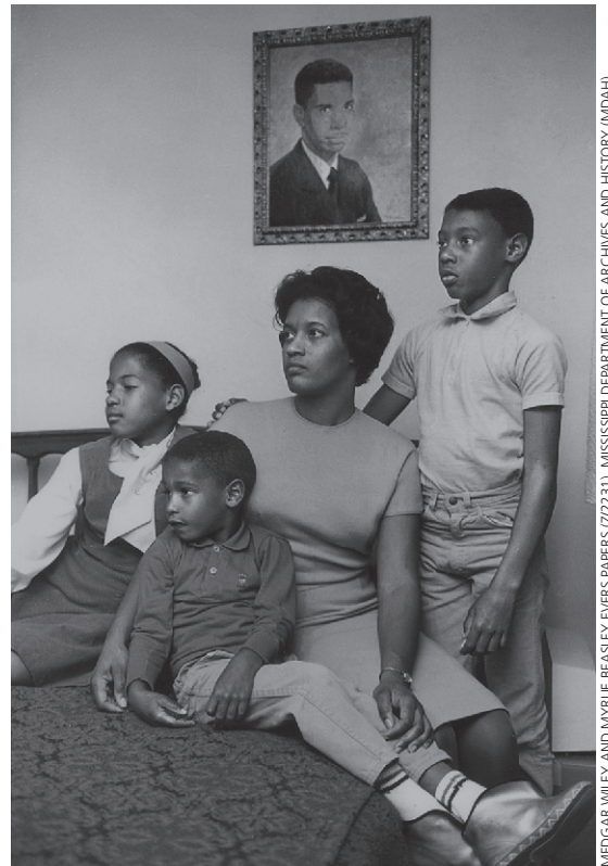
The public faces of the 1960s Civil Rights Movement were often men, with women usually occupying roles behind the scenes. The Evers maintained such a partnership until Medgar’s assassination thrust