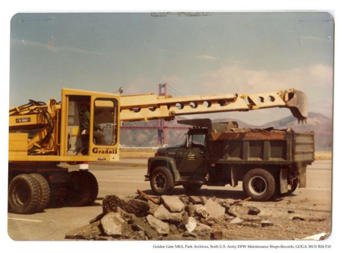
Photograph of Roads and Pavement Branch work on Crissy Army Air Field with the Golden Gate Bridge in the background, no date (B26\,F10) .

The Sixth U.S. Army, Directorate of Public Works, Maintenance Shops Records, dating from 1776 to 1999 with bulk dates from 1950-1995, documents the management of various operations and maintenance shops in their duties at the Presidio of San Francisco and its sub-installations, including Fort Baker, Fort Barry, Fort Cronkhite, Fort Funston, Fort Mason, Fort Point, Fort Winfield Scott, and multiple Bay Area Army Ph Reserve Centers.