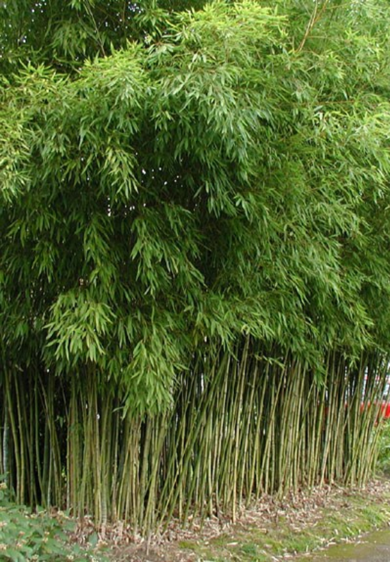
Golden Bamboo Phyllostachys aurea

Privet has opposite leaves, white flowers, and berries that range from green to black. It can grow up to 30 ft. in height and forms dense thickets.