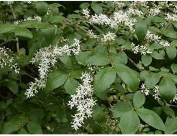
Chinese Privet Ligustrum sinense

Privet has opposite leaves, white flowers, and berries that range from green to black. It can grow up to 30 ft. in height and forms dense thickets.