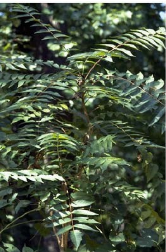
Tree of Heaven Ailanthus altissima

Golden bamboo has alternate, grass-like leaves and can reach heights of 24 to 30 ft. It shades out native plants and destroys wildlife habitat.