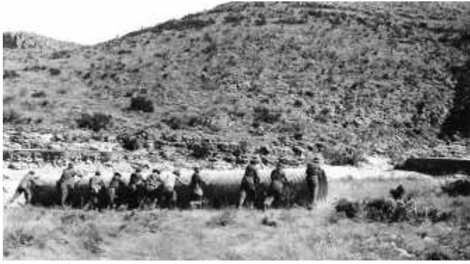
Figure 7. CCC workers installing large culverts along the park road after devastating flood of 1941.

Throughout New Mexico from 1933 to 1942 the Civilian Conservation Corps responded to emergencies: fire-fighting, search and rescue, and flood control work. After the devastating September 1941 flood, they helped to rebuild the flood-damaged Walnut Canyon road. By the time that they left here in May 1942, the Civilian Conservation Corps had contributed much to the making and the maintaining of facilities at Carlsbad Caverns National Park and in the process left a visual legacy for them.