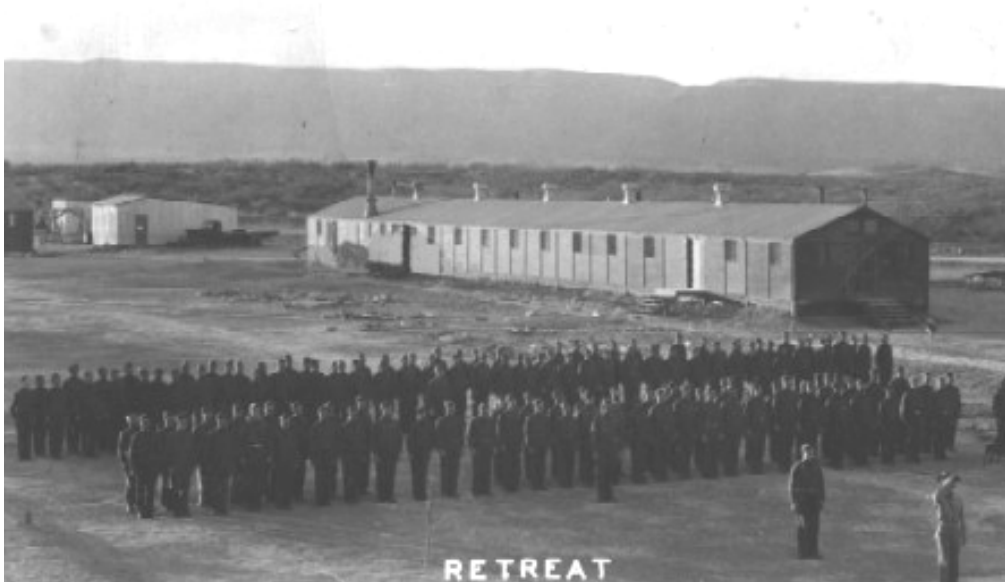
Figure 9. Retreat ceremony at the Rattlesnake Springs Camp, date unknown.

Several months ago I wrote an article in the Carlsbad Current Argus about the history of the Civilian Conservation Corps at our park that included the picture above of CCC workers resurfacing the floor in the park's underground lunchroom. Two brothers read that article and thought that they recognized their father who worked here as a CCC foreman at the Rattlesnake Springs Civilian Conservation Corps camp. They asked me to send them a larger version of the picture so that they could possibly identify their dad. While it turned out not to be their dad, they sent our park some wonderful CCC pictures and a list of CCC names that included their father's name. Their kind donation of pictures included the following: