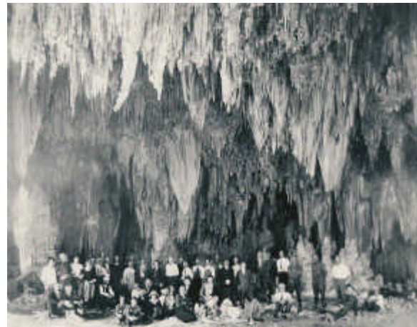
Figure 3. 1924 Ray V. Davis photograph of the King's Palace, Carlsbad Cave National Monument.

operations in the southwest. Davis's pictures—the result of Jim White's invitation to Davis to take photographs—started the political momentum for the monument's creation. In November 1923, the month after the monument's creation, some of Davis's cavern pictures appeared in The New York Times .