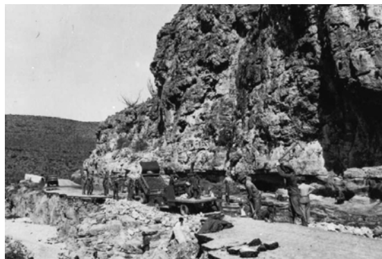
Figure 6. CCC workers repairing the flood-damaged park road in September 1941.

Other Civilian Conservation Corps construction "projects" still used today include the two triplexes and the maintenance office and shed. Originally, the triplexes were to be built with quarried limestone, but after a short period of quarrying the abundant, but difficult-to-quarry rock, Civilian Conservation Corps workers must have been relieved to see the construction plans shifted to adobe bricks construction. Adobes were made somewhere off the current "loop road," a 9 ½ mile drive through the Chihuahuan Desert for the enjoyment of today's visitors.