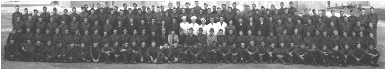
Figure 10. A group shot, date unknown. Can you spot the cooks and the supervisors? Some of these boys, now in their 70s and 80s, belong to Civilian Conservation Corps alumni groups today.

In our park museum collection, we have a table and chairs built by CCC workers (probably in northern New Mexico). Maybe the CCC reading room is where our park's CCC furniture came from?