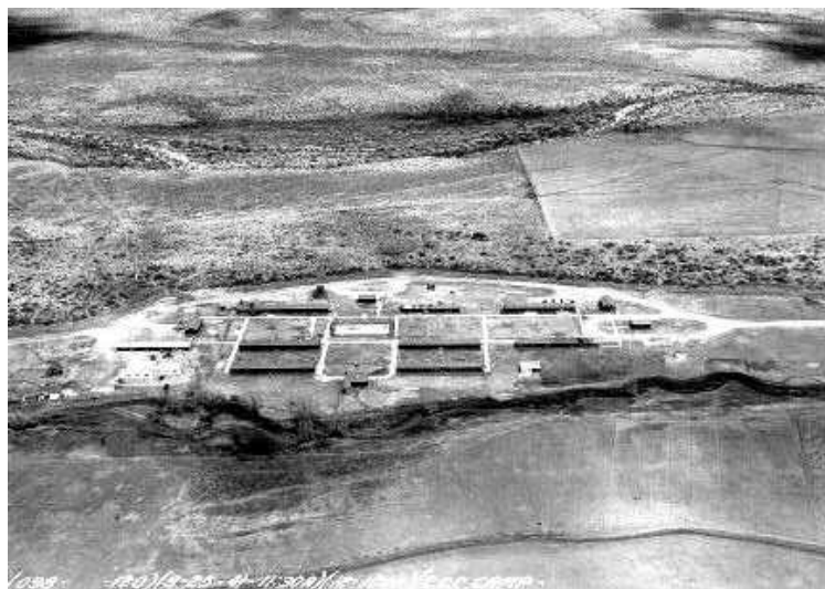
Figure 5. View of Civilian Conservation Camp “NP-1-N” at Rattlesnake Springs, Carlsbad Caverns National Park, ca. late 1930s.

The Civilian Conservation Corps “was an organization formed as part of Roosevelt's New Deal as an attempt to counter the rampant unemployment and economic despair resulting from the Great Depression. Formed by an act of Congress and upon the request of President Franklin Delano Roosevelt in 1933, the Civilian Conservation Corps was an organization unique in American History. The Civilian Conservation Corps were a group of men, mostly youths but also World War One Veterans or Skilled Laborers in their own companies, formed across the country and utilized for a wide range of skilled and unskilled labor in the