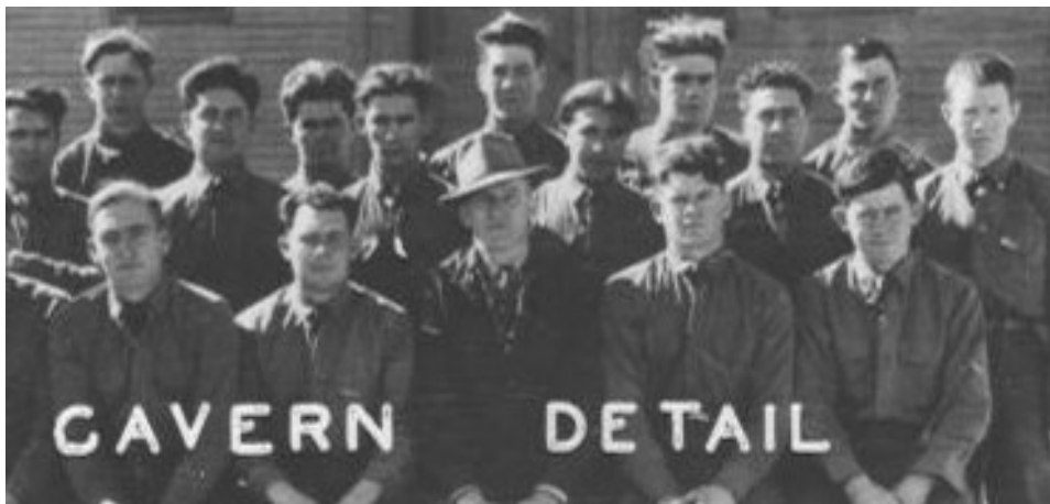
Figure 12. "Details" such as these young men accomplished many projects at Carlsbad Caverns National Park, 1938 to 1942.