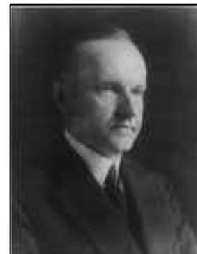
Figure 1. President Calvin Coolidge.

NOW, THEREFORE, I, Calvin Coolidge, President of the United States of America, by authority of the power in me vested by section two of the act of Congress entitled, "An Act for the preservation of American antiquities," approved June eighth, nineteen hundred and six (34 Stat., 225) do proclaim that there is hereby reserved from all forms of appropriation under the public land laws, subject to all valid existing claims, and set apart as a National Monument to be known as the Carlsbad Cave National Monument all that piece or parcel of land in the County of Eddy, State of New Mexico, shown upon the diagram hereto