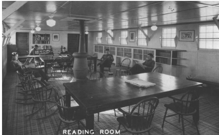
Figure 11. One of the recreations of CCC enrollees was reading.

Putting an article in the newspaper with some historical photographs "turned up" these photographs through the kindness of the two donor-brothers, photographs of great value to our collection. From time to time, I meet visitors or receive calls from other people who want to share their memories or photographs or other items from their personal historical connection to our park. Because of such people, we continually learn more about our park's history. Some people donate items; others let us scan or copy pictures.