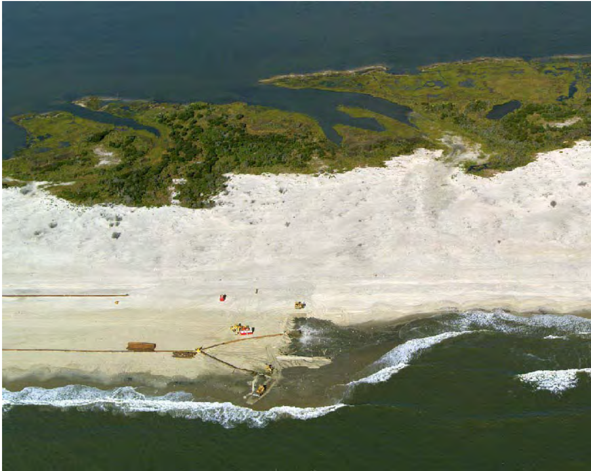
Figure 3. The first stage of the North End Restoration Project took place during September, 2002 as sediment is deposited on the beach of northern Assateague Island through pipes and then spread out by bulldozers, extending the shoreline into the ocean.

The first stage of the North End Restoration Project was undergone in September, 2002 ( Figure 3 ) as 1.4 million cubic meters (1.8 million cubic yards) of sand was placed seaward of the mean high waterline to minimize disturbance to upland habitats. The second stage of the beach replenishment project was then initiated in January of 2004, and continues with sediment dredged and placed in the nearshore of Assateague Island twice a year. Please see the 'Project Timeline' PDF for details on the dates, amount of sediment moved, and location of events. In an effort to monitor the effects of the North End Restoration Project, as well as the condition and surrounding effects of the emergency storm berm (which was rebuilt in 2002), ASIS and USACE researchers have been collecting a variety of ecological and geomorphological data in this area. This website is designed to provide locations and progress of these monitoring datasets, as well as general information, a timeline of activities, and a list of contacts pertaining to the ASIS North End Restoration Project.