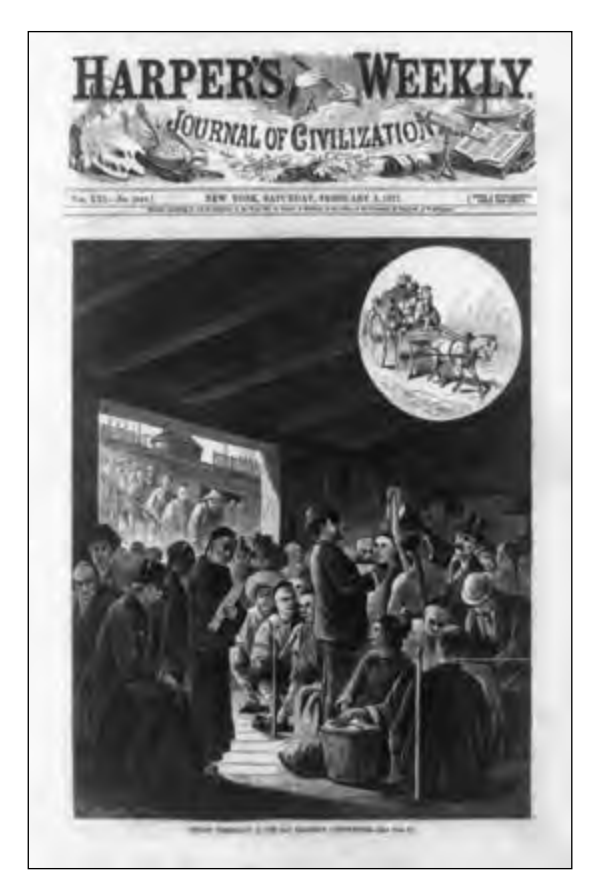
Newly arrived Chinese immigrants wait as their belongings are inspected in a customs house. Illustration published in Harper's Weekly, Feb. 3, 1877.

African Americans, considered "aliens," "property," and "other Persons" for nearly the first century of the U.S. nation-state, only became "persons" in 1868 with the adoption of the 14th Amendment, which allowed that "all persons born or naturalized in the United States...are citizens...." In 1924, Congress granted citizenship to American Indians, former "aliens," who were born after that year. All American Indians were absorbed as U.S. citizens in 1940. Asians remained "aliens ineligible to citizenship," per the 1790 Naturalization Act until 1952, when Japanese and Koreans were the last Asians to receive naturalization rights.