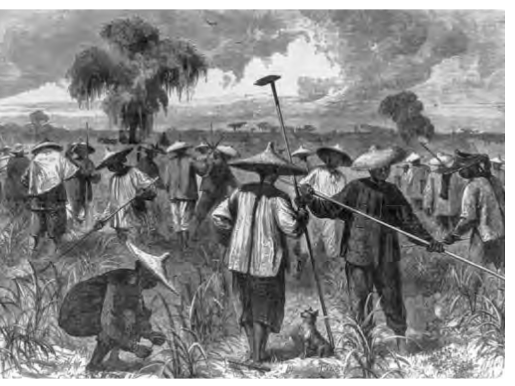
Chinese laborers at work on the Milloudon Sugar Plantation in Louisiana. Woodblock print by Alfred Waud; published in Every Saturday, July 29, 1871. Courtesy of the Library of Congress.

Labor recruiters procured Hawaiians to work in Peru, where many of them perished from diseases and unforgiving work conditions. Over a two-year period beginning in 1845, nearly 2,000 Hawaiians served on foreign ships, and by 1850 that total reached 4,000, or almost one-fifth of the Hawaiian kingdom's population of adult males. To benefit from that labor migration and limit the loss, the kingdom imposed a poll tax on foreign employers of Hawaiians who, by mid-century, were toiling on ships and on land from Tahiti and Peru to the south to the Pacific Northwest and Alaska to the north. Hawaiians served in the Mexican navy and worked on Russian holdings along the west coast. By 1830, Hawaiians comprised the majority of the crewmembers on U.S. ships on the west coast, and they were also found in the Atlantic and its port cities.