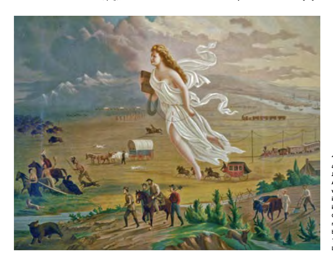
"American Progress," a famous painting by John Gast, depicts the American spirit leading westward expansion. in keeping with the idea of Manifest Destiny. Chromolithograph reproduction published by George A. Crofutt, 1873; courtesy of the Library of Congress.

The U.S. is an imperial republic because the nation began as a product of English expansion into the Atlantic world and as a white settler colony that appropriated American Indian lands through negotiations as well as conquest by force. That extra-territorial spread engulfing Indian country continued after independence. In the 19th century, the Louisiana Purchase added not only land but also new populations to the nation: