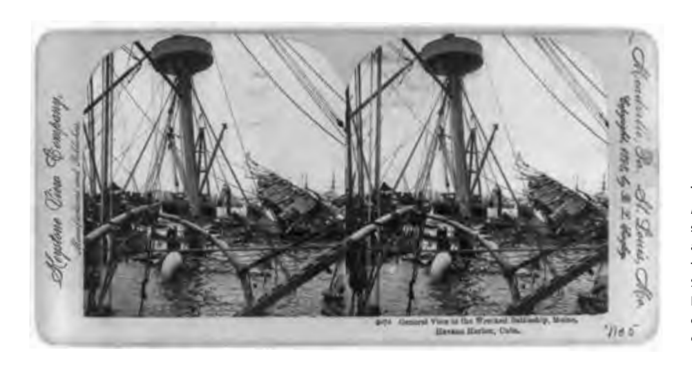
The destruction of the USS Maine in Havana Harbor, Cuba, sparked war between America and Spain as the former began to eye territories overseas. Stereographic print published by the Keystone View Co., c.1898; courtesy of the Library of Congress.

spirit—rugged individualism, initiative and self-reliance, and democratic values. Moreover, the engine for the nation's economic growth was the energy generated by the constantly expanding frontier with its seemingly limitless resources and opportunities. Its closure, thus, was a cause for alarm. Capitalism's crisis of the 1890s served to reinforce those fears. Markets and land and labor abroad seemed to offer exits that the frontier's continental end appeared to foreclose. Pressed from within, the U.S. sought outlets abroad.