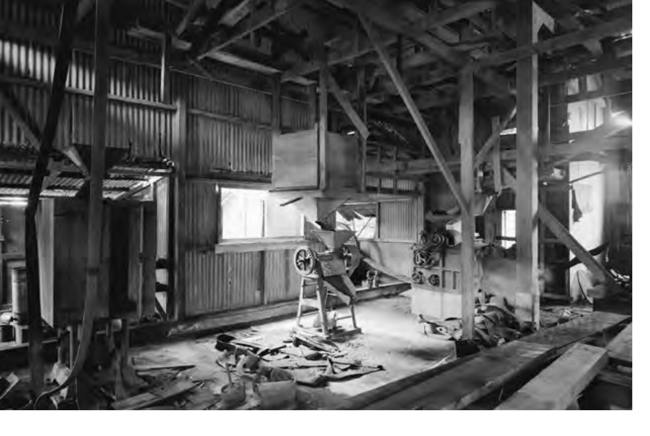
In addition to sugar and fruit, rice cultivation by Japanese and Chinese workers in Hawai'i began in the 1860s and became a staple of the Hawaiian economy. The rice was processed in waterpowered mills like the Haraguchi Rice Mill on Kauai, pictured here.

The nation-state first emerged from the generative, destructive world-system as an extractive, plantation colony on the periphery of Europe's core. Like many other settler colonies the world over, in the U.S., settlers rose up in rebellion against their colonial masters, gained their independence, and formed a sovereign nation-state that became a member of the core through its concentration of capital, deployment of labor, and flexing of imperial powers.