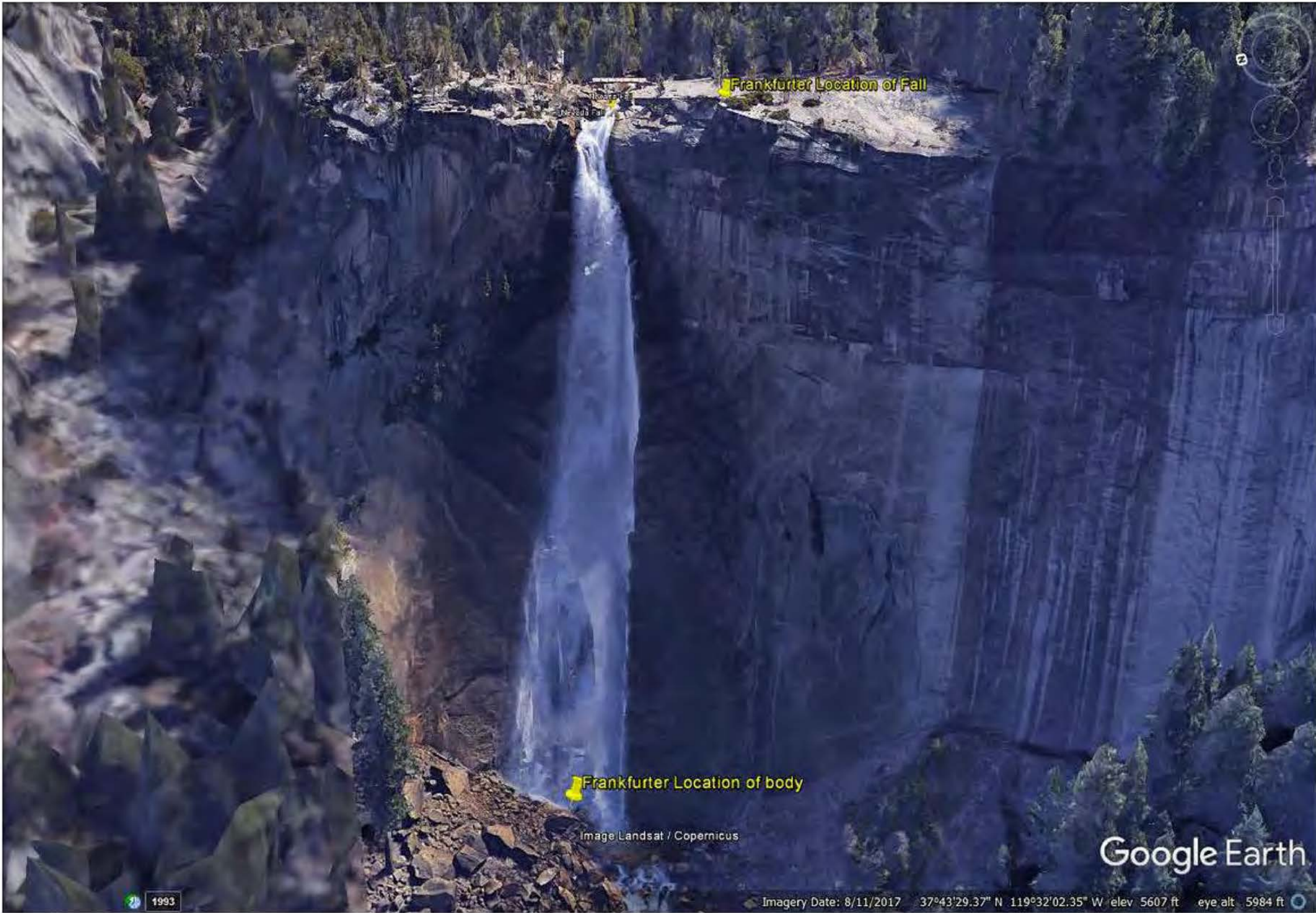
Frankfurter ● Overview of Fall Path