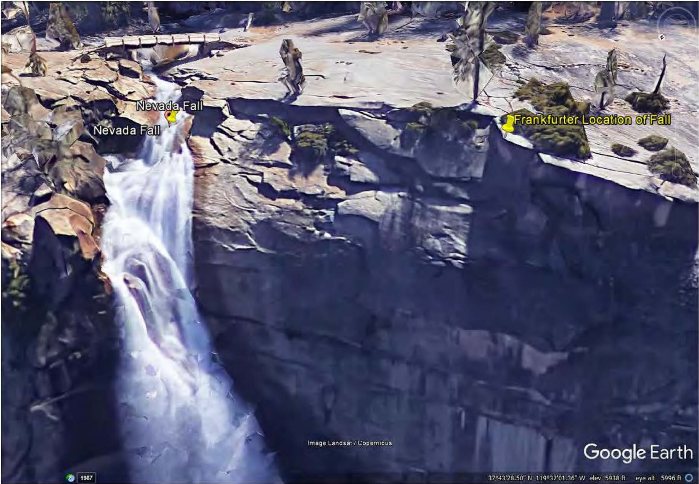
Frankfurter Location of Fall