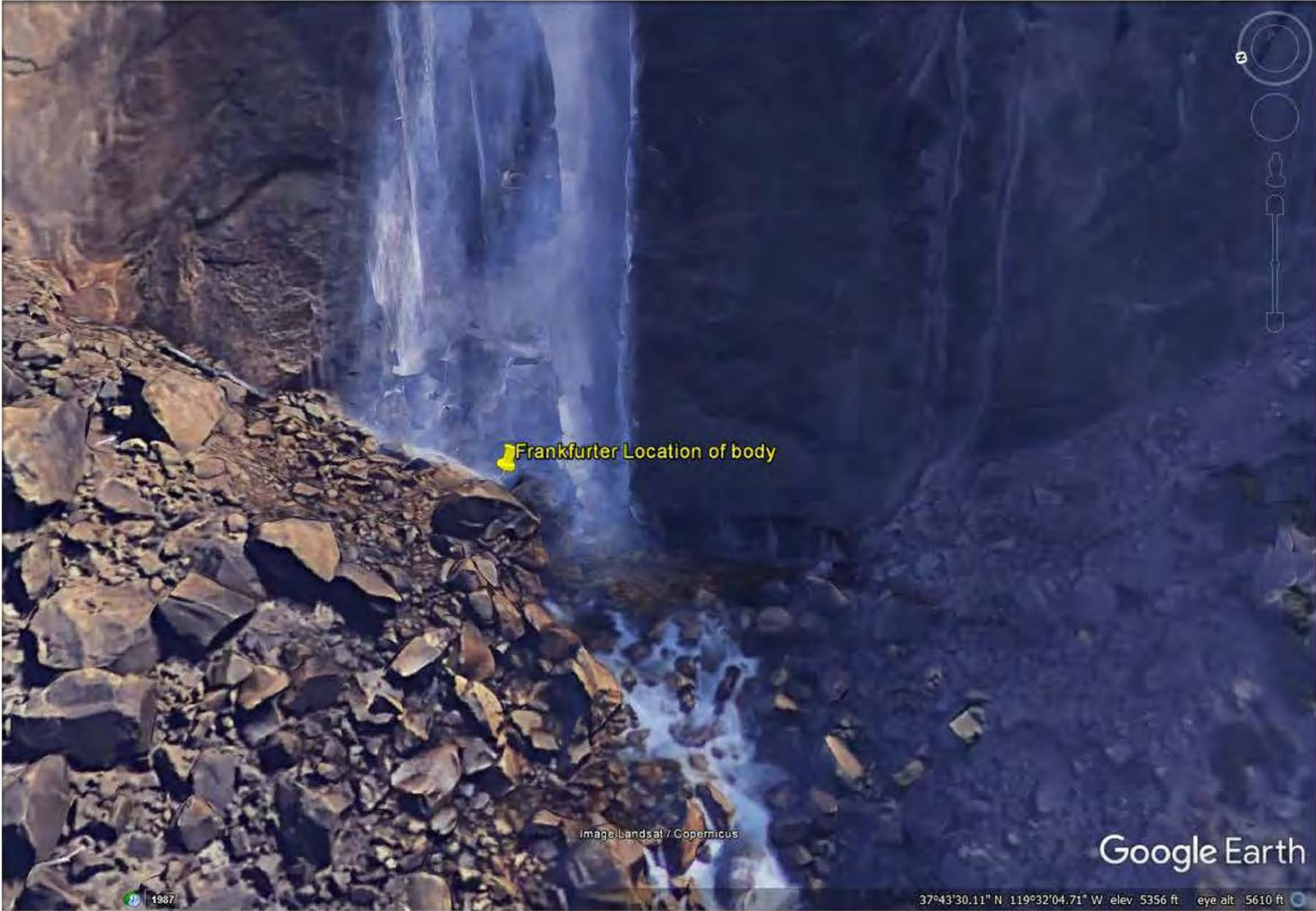
Frankfurter Location of Body